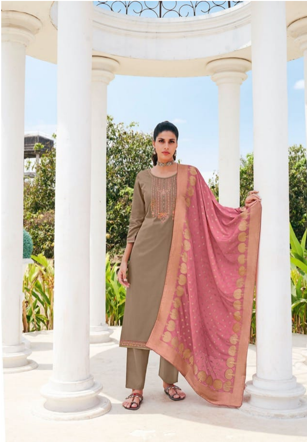
Different cultures come together in a tribute to fashion's biggest moment this season