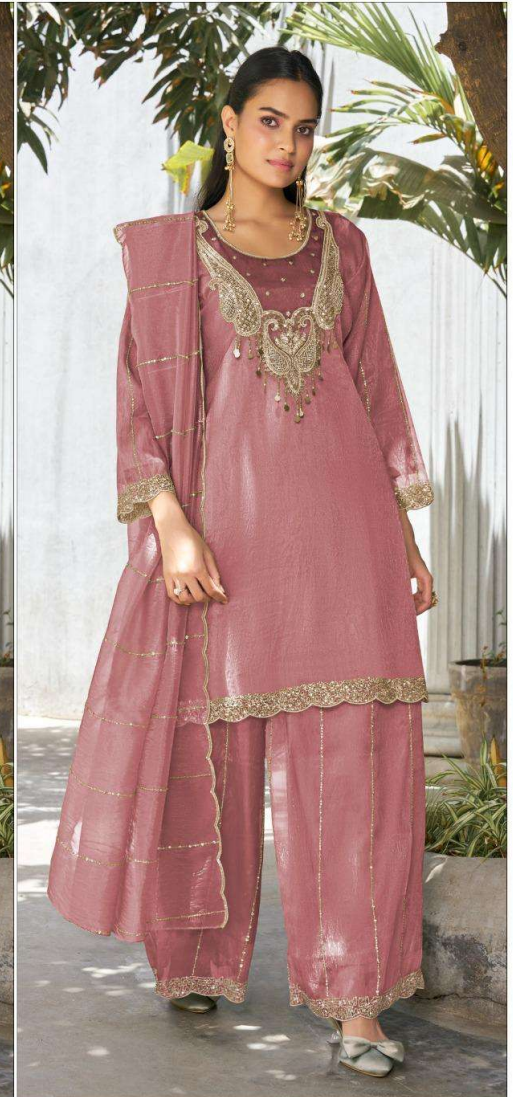
D~ 3487 D