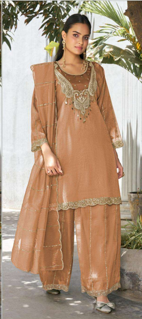
D~ 3487 B