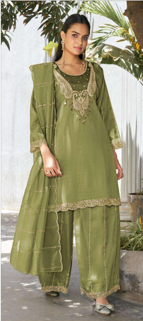
D~ 3487 A