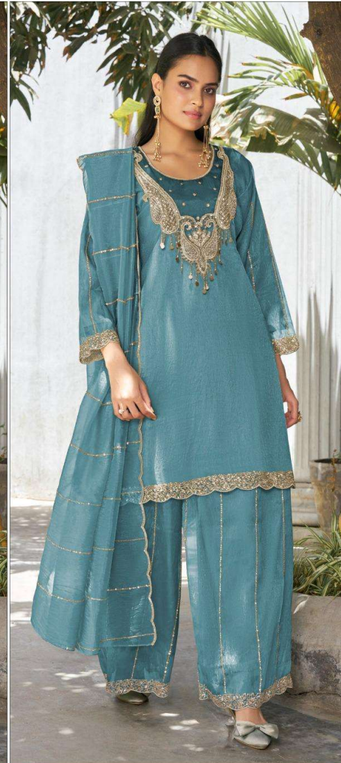
D~ 3487 C