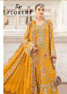
D.NO.1056-B TOP- EMBROIDERED HEAVY CHIFFON WITH HEAVY HAND KHATLI WORK DUPATTA- CHIFFON EMBROIDERED BOTTOM / INNER- SANTOON