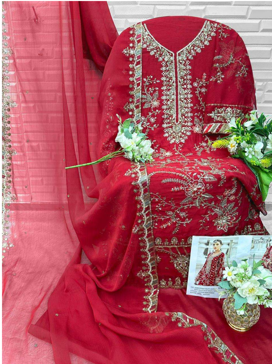
FLORENCE TOP: EMBROIDERED HEAVY CLOTH WITH HEAVY BRAND KHAZELI WOOL. DETAILED: GOLDEN EMBROIDERED. BOTTOM: LINEN - SANTON