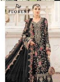
TOP- EMBROIDERED HEAVY CHIFFON WITH HEAVY HAND KRAITLI WORK DUPATTA- CHIFFON EMBROIDERED BOTTOM / INNER- SANTOON