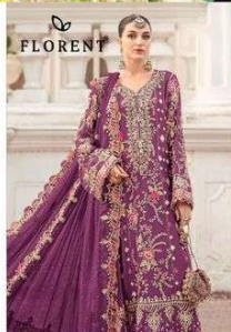
TOP: EMBROIDERED HEAVY CHIFFON WITH HEAVY HAND KHATLI WORK DUPATTA: CHIFFON EMBROIDERED BOTTOM / INNER: SANTOON