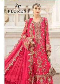
TOP- EMBROIDERED HEAVY CHIFFON WITH HEAVY HAND KHATLI WORK DUPATTA- CHIFFON EMBROIDERED BOTTOM / INNER- SATYON