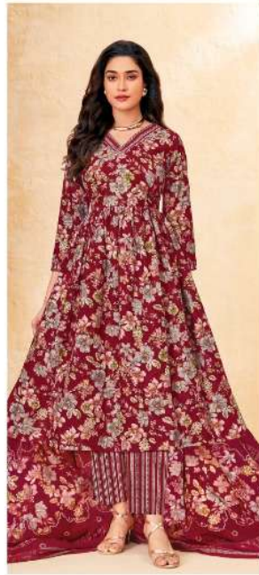
D No. 213