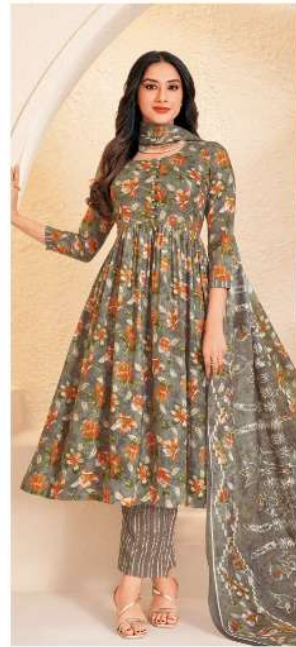
D No. 215