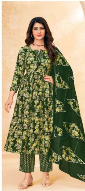
D No. 212