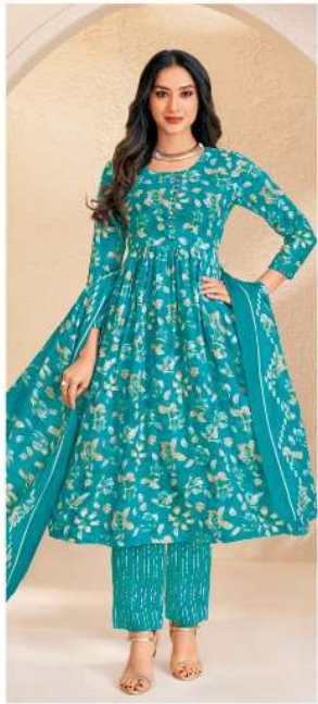
D No. 208