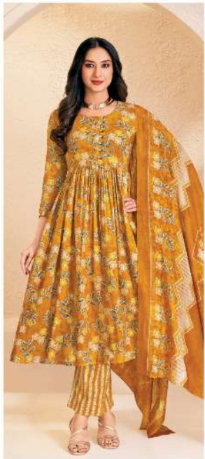
D No. 210