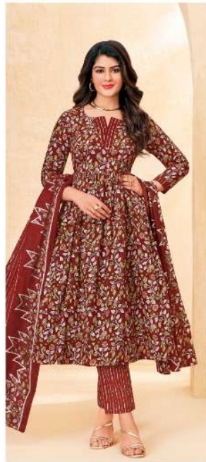
D No. 216