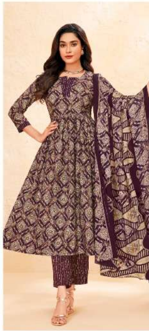
D No. 209