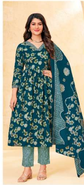
D No. 214