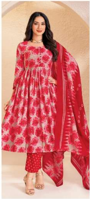
D No. 207