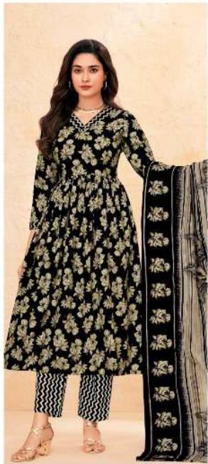
D No. 211