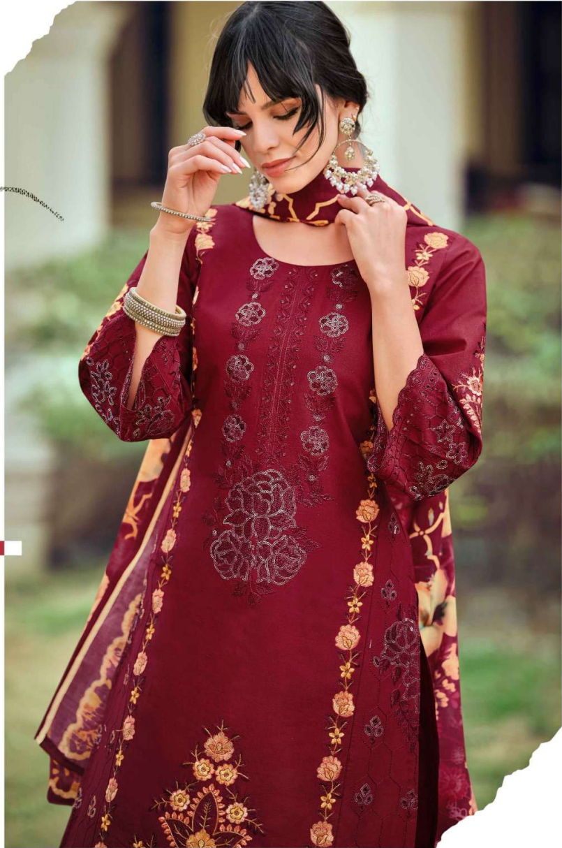
Fashion is architecture, It is a matter of proportion.