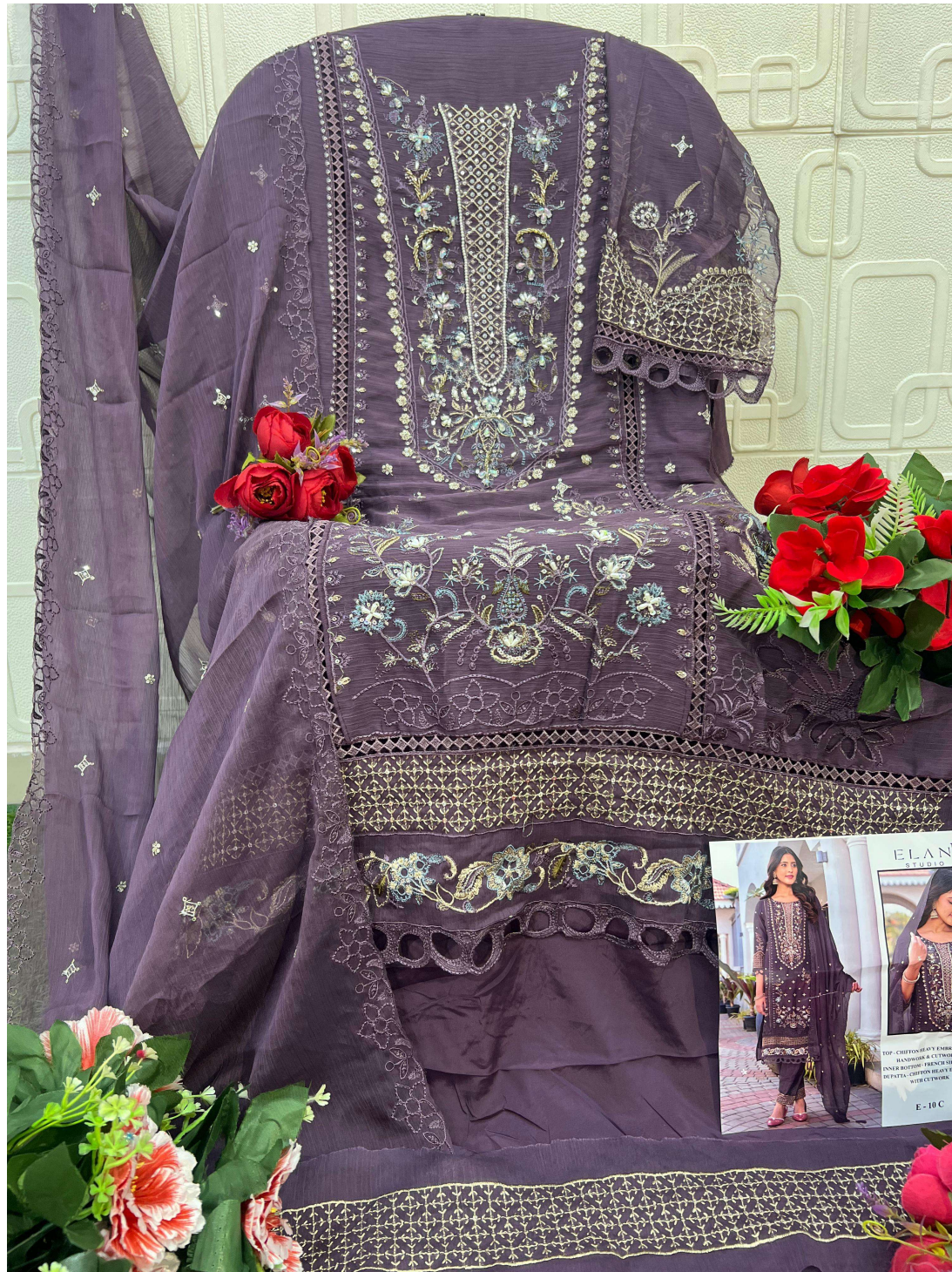
ELAN TM STUDIO TOP: CHIFFON W/ EMBROIDERY HANDMADE & CUTWORK INNER BOTTOM: TRENCH COAT DETAILS: CHIFFON BELLYBAND WITH CUTWORK E-10 C