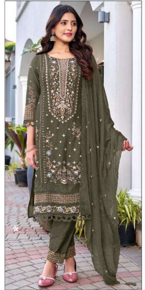
E - 10 D