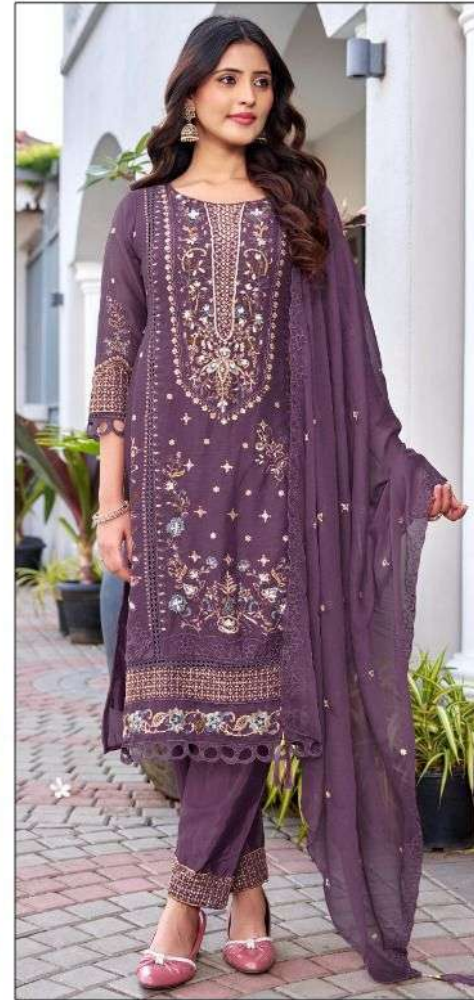
E - 10 C