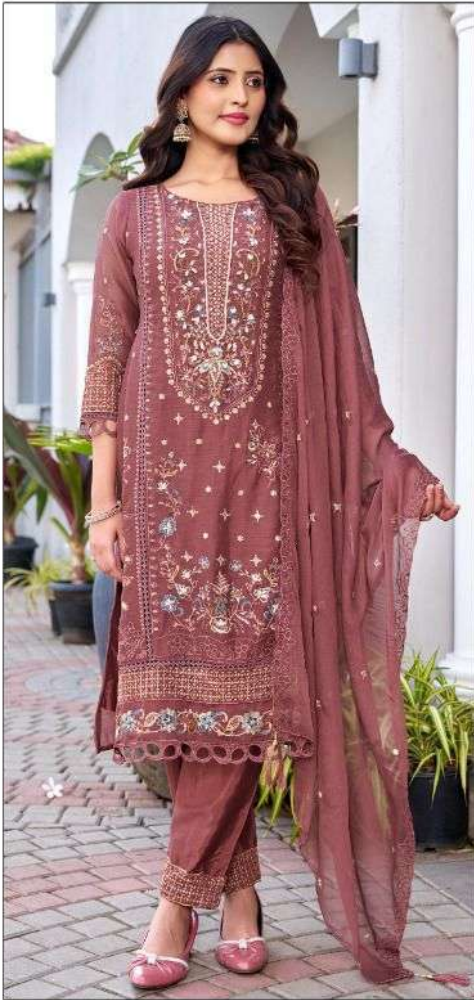
E - 10 A

TOP - CHIFFON HEAVY EMBROIDERED WITH HANDWORK & CUTWORK INNER BOTTOM - FRENCH SILK WITH EMB LACE DUPATTA - CHIFFON HEAVY EMBROIDERED WITH CUTWORK