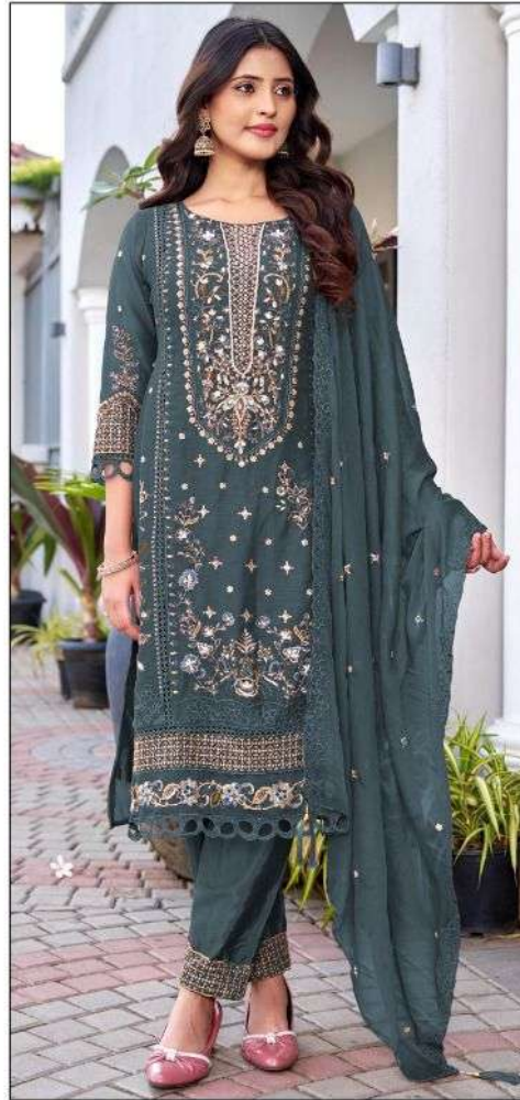
E - 10 B