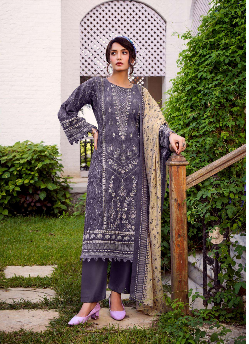
1127-005 when we chose to take inspiration form indian beauty the result is the result is here a set of vivid colorful design told a story about fashion.