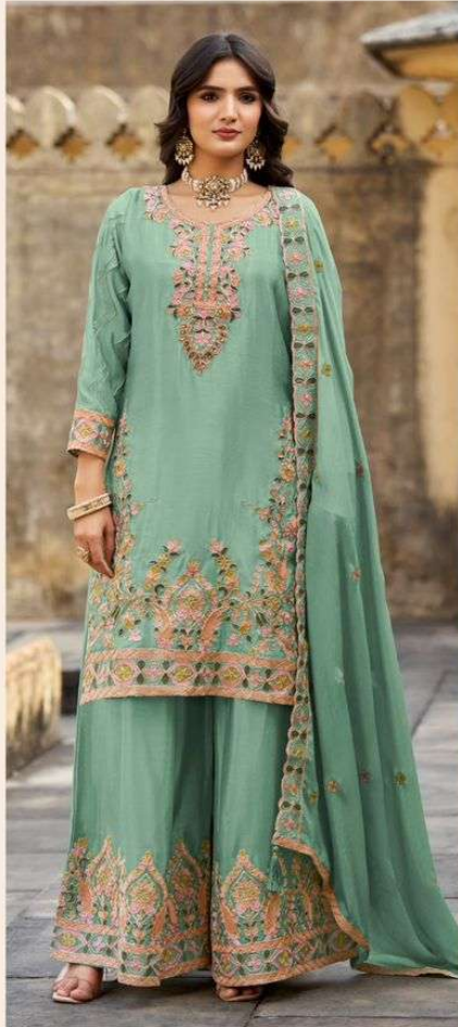
17061 - A