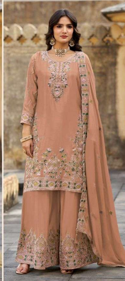
17061 - C