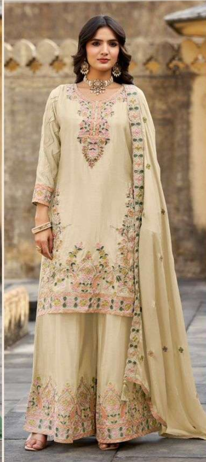
17061 - B