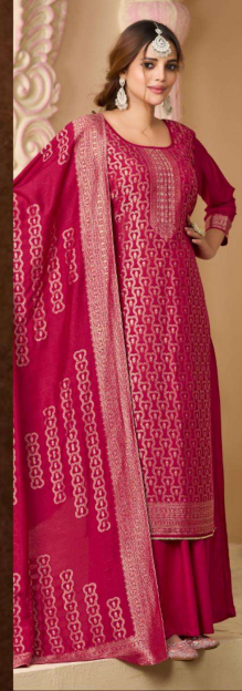
DN | 18254