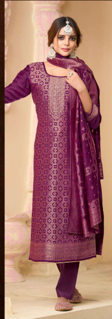
DN | 18256

[TOP] MUSLIN JEQUARD 3D WEAVING WITH DIAMOND WORK [BOTTOM] HEAVY BSY COTTON [DUPATTA] MUSLIN JEQUARD 3D WEAVING