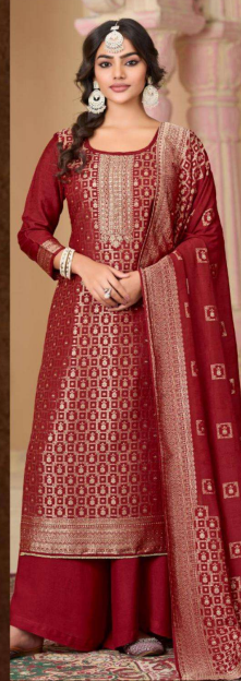
DN | 18252