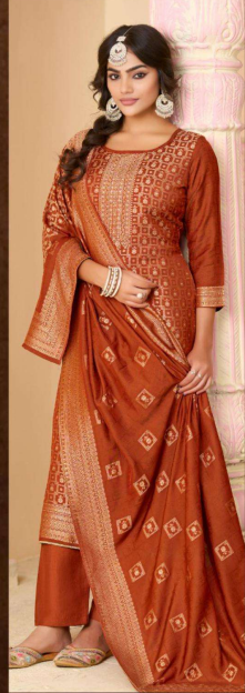
DN | 18251