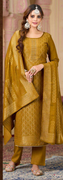
DN | 18253