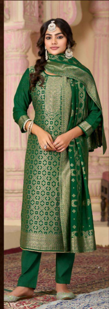
DN | 18255