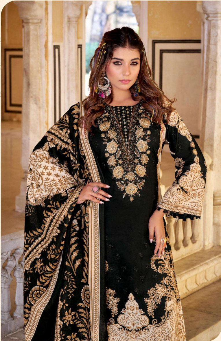
The sheer lusciousness of the print provides a boost to the natural beauty.