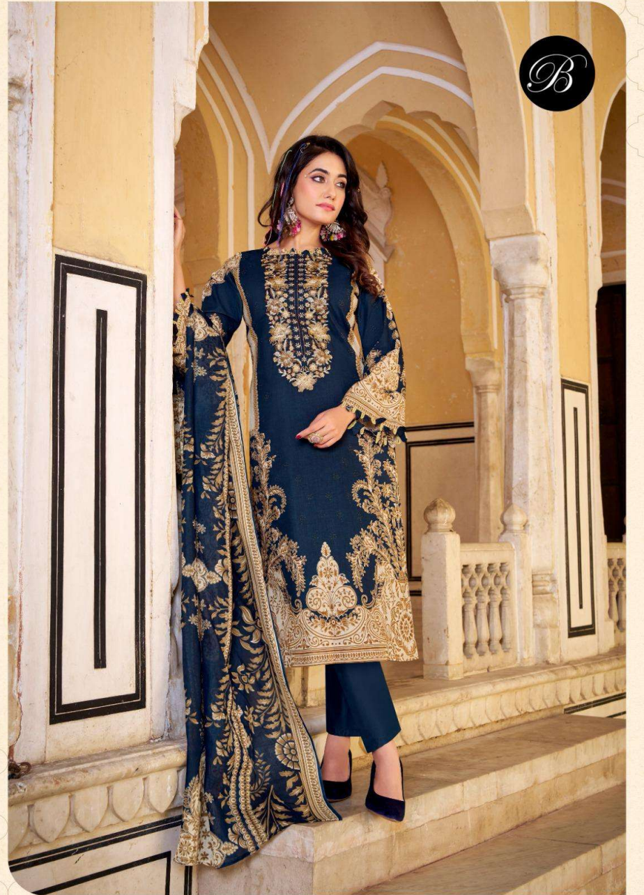
The gorgeous combination of geometrical design with young charming colours. 920-004