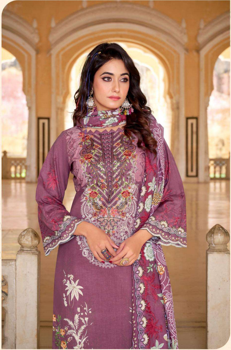
The gorgeous combination of geometrical design with young charming colours.