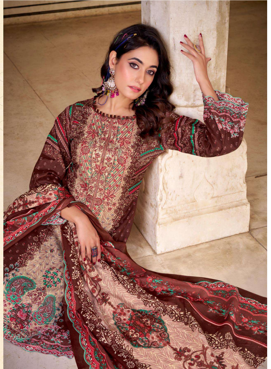
920-008 Ethnic indian couture that defines poise and charisma at its best.