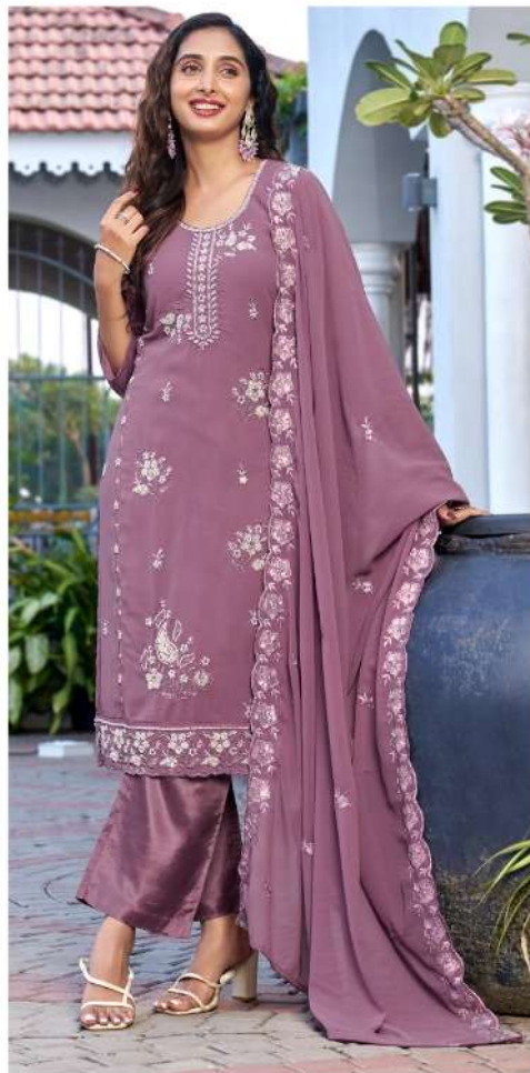
AV - 1025 A

Top - Heavy fox georgette with beats work Dupatta - Heavy fox georgette with embroidery work Bottom - Dull santoon