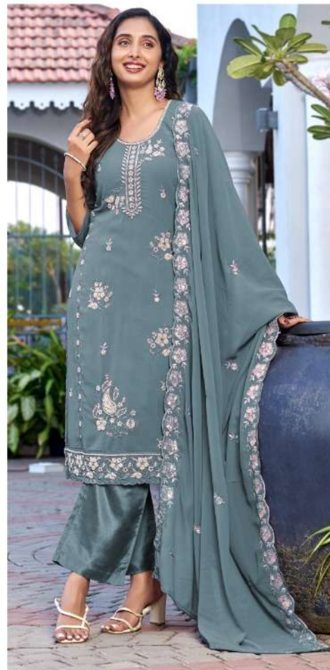
AV - 1025 C