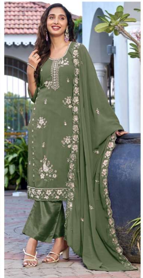
AV - 1025 D