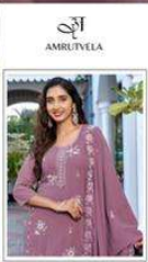
AV - 1025 A Top - Heavy fix georgette with beata work Dupatta - Heavy fix georgette with embroidery work Bottoms - Dull santon