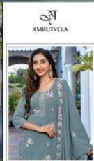
AMRUTVELA AW - 1023 C Top - Heavy for gangrene with heavy work Dupatta - Heavy for gangrene with embroidery work Bottom - Full saree