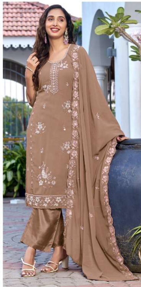
AV - 1025 B