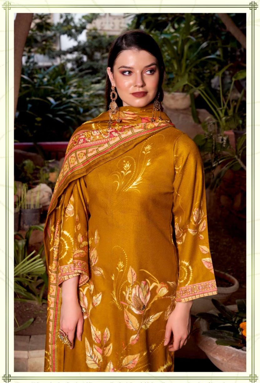
Unique shade of red and the warmth of subtle print is together an avalanche of beauty.