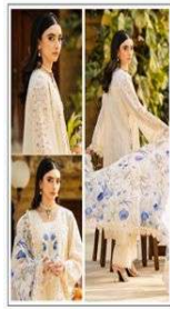
D.NO.-181 B TOP-CAMBRIC COTTON WITH HEAVY EMBROIDERY WORK BOTTOM-CAMBRIC COTTON DETAILS-KNOT/CHEENI WITH HEAVY EMBROIDERED