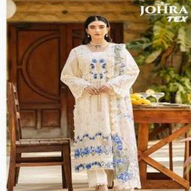
D.NO.-181 B TOP-CAMBRIC COTTON WITH HEAVY EMBROIDERY WORK BOTTOM-CAMBRIC COTTON DETAILS-KNOT/CHEENI WITH HEAVY EMBROIDERED