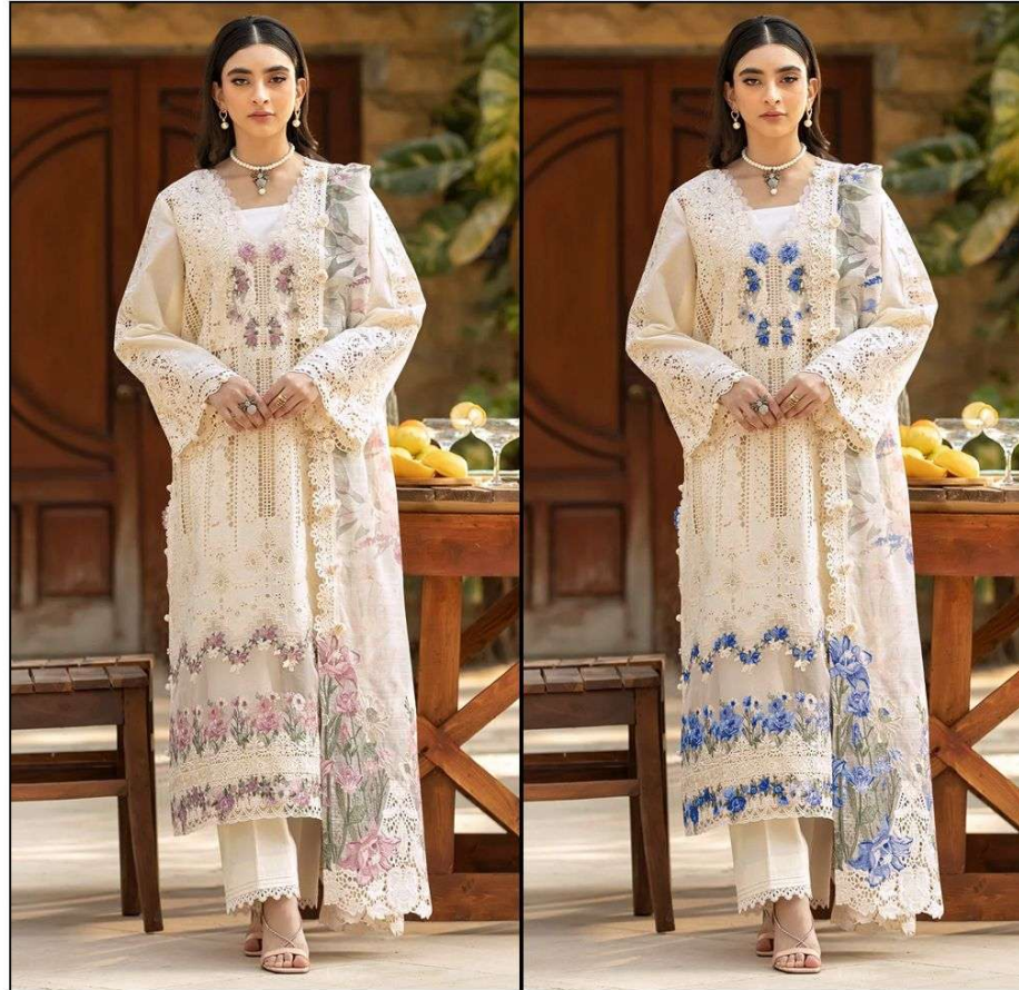
D.NO 181 A