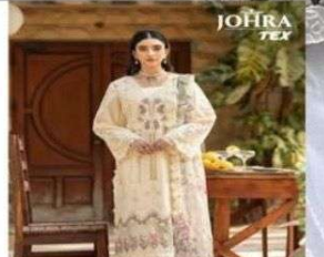
D.NO-181 DIN WITH DELICATE EMBROIDERY WORK ON CLOTHING KITTY DIN WITH DELICATE EMBROIDERY WORK