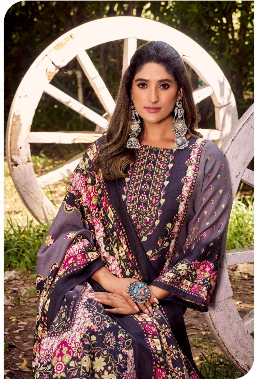
Unique shade of red and the warmth of subtle print is together an avalanche of beauty.