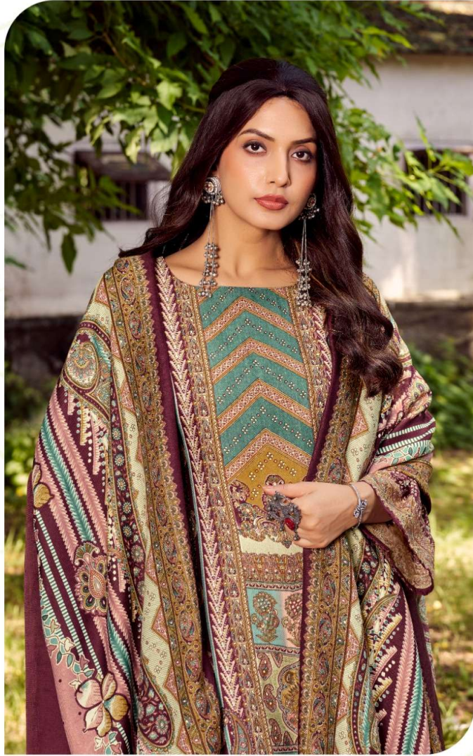
The sheer lusciousness of the print provides a boost to the natural beauty.