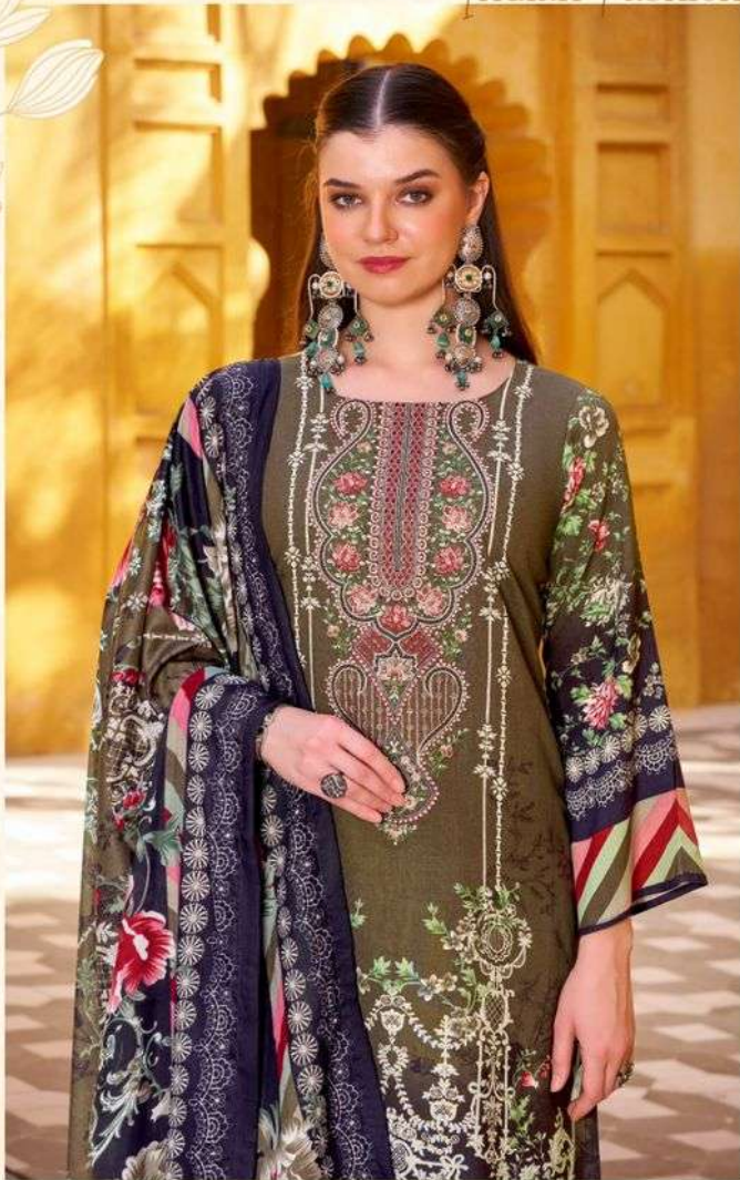
The gorgeous combination of geometrical design with young charming colours.