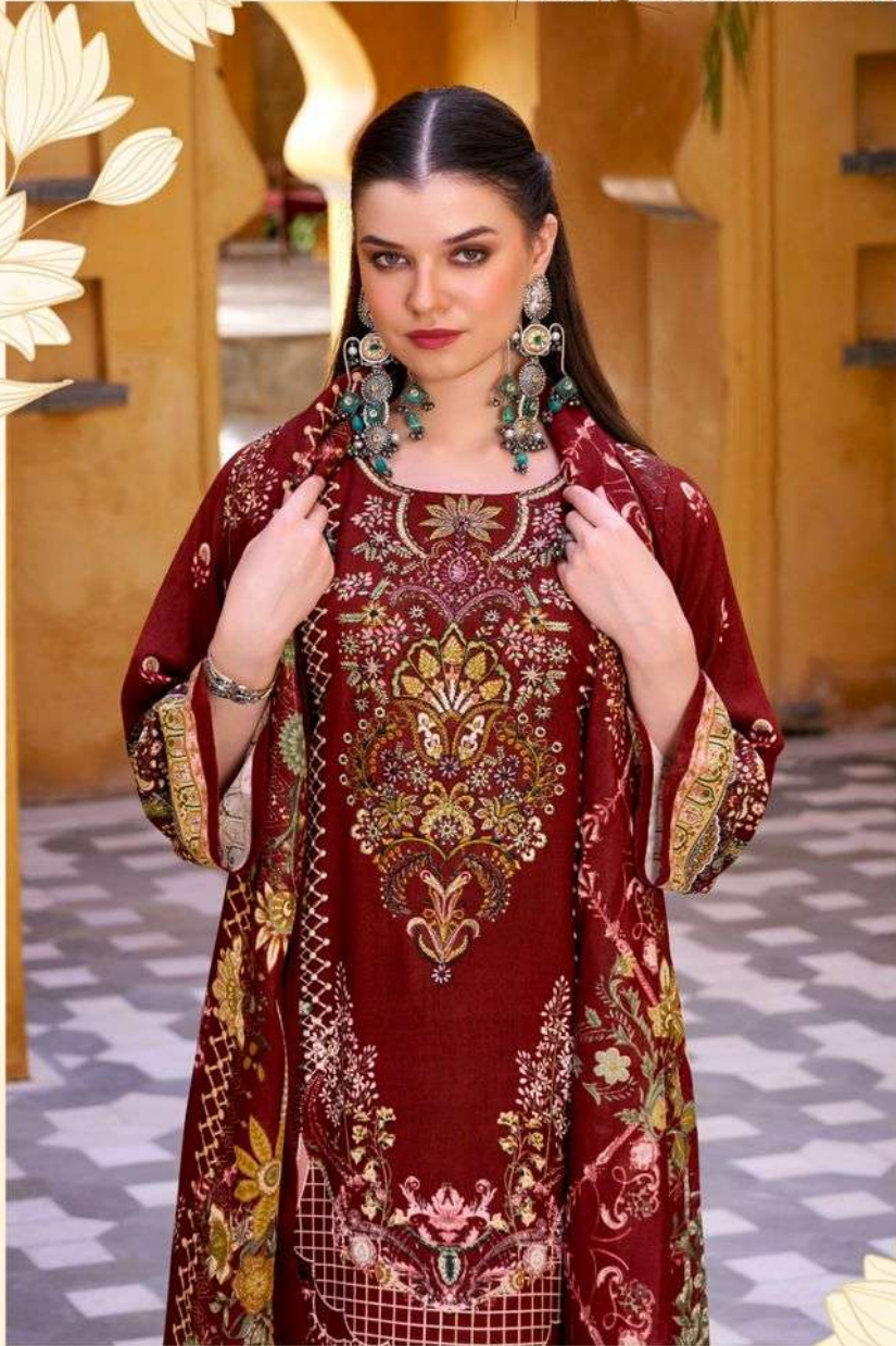
901-002 The silent colours and beautiful print provide a spark to the persona.