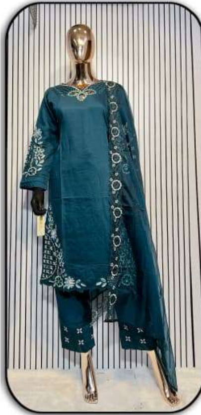
D.No. - 014 B