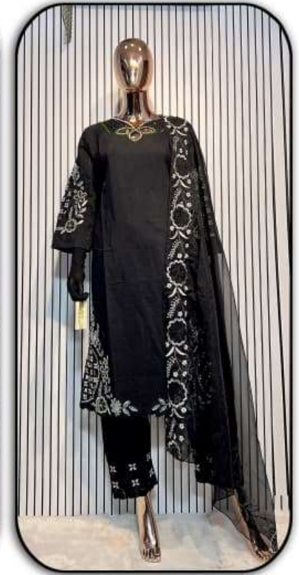
D.No. - 014 D