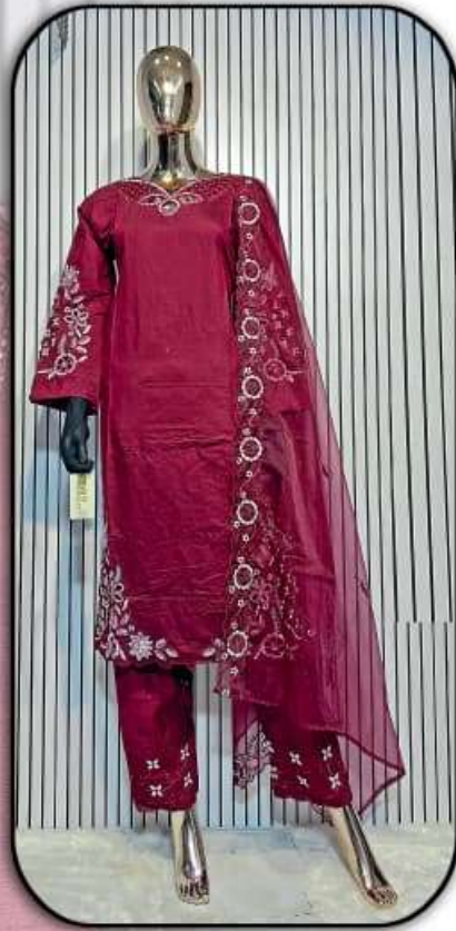
D.No. - 014 A

D UPATTA :- ORGENZA WITH EMBROIDERY CUT WORK