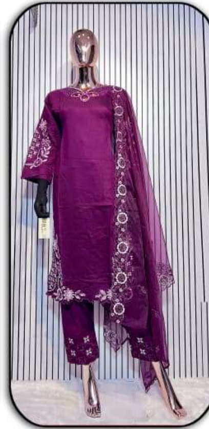
D.No. - 014 C