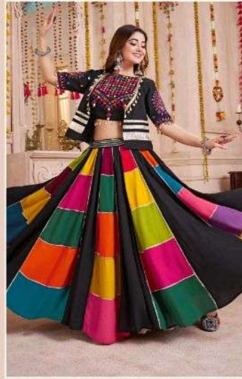
RASS - 11142