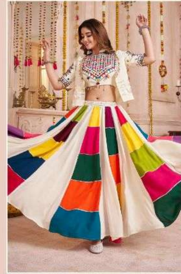
RASS - 11143