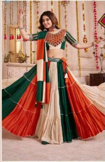
RASS - 11141