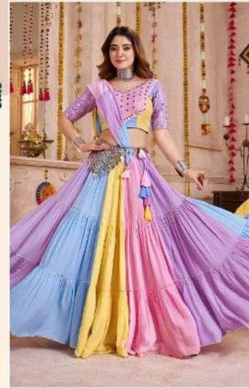
RASS - 11145