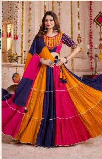
RASS - 11144