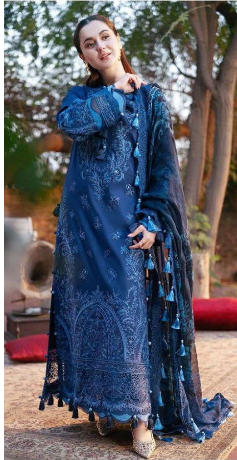
D NO 26001