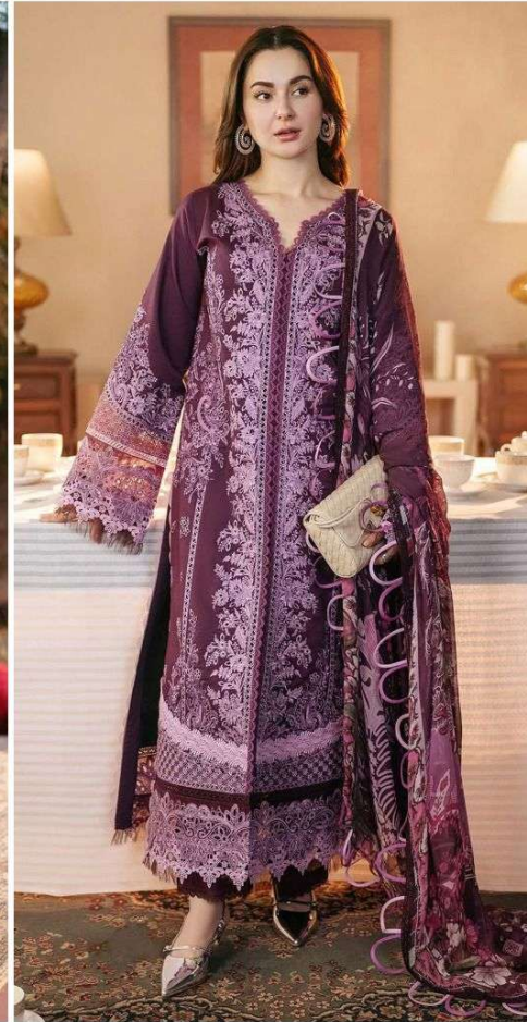
D NO 26002

TOP:- PURE COTTON WITH HEAVY EMBROIDERY CHIKANKARI WORK BOTTOM:- COTTON DUPATTA:- MUSLIN COTTON WITH DIGITAL PRINT