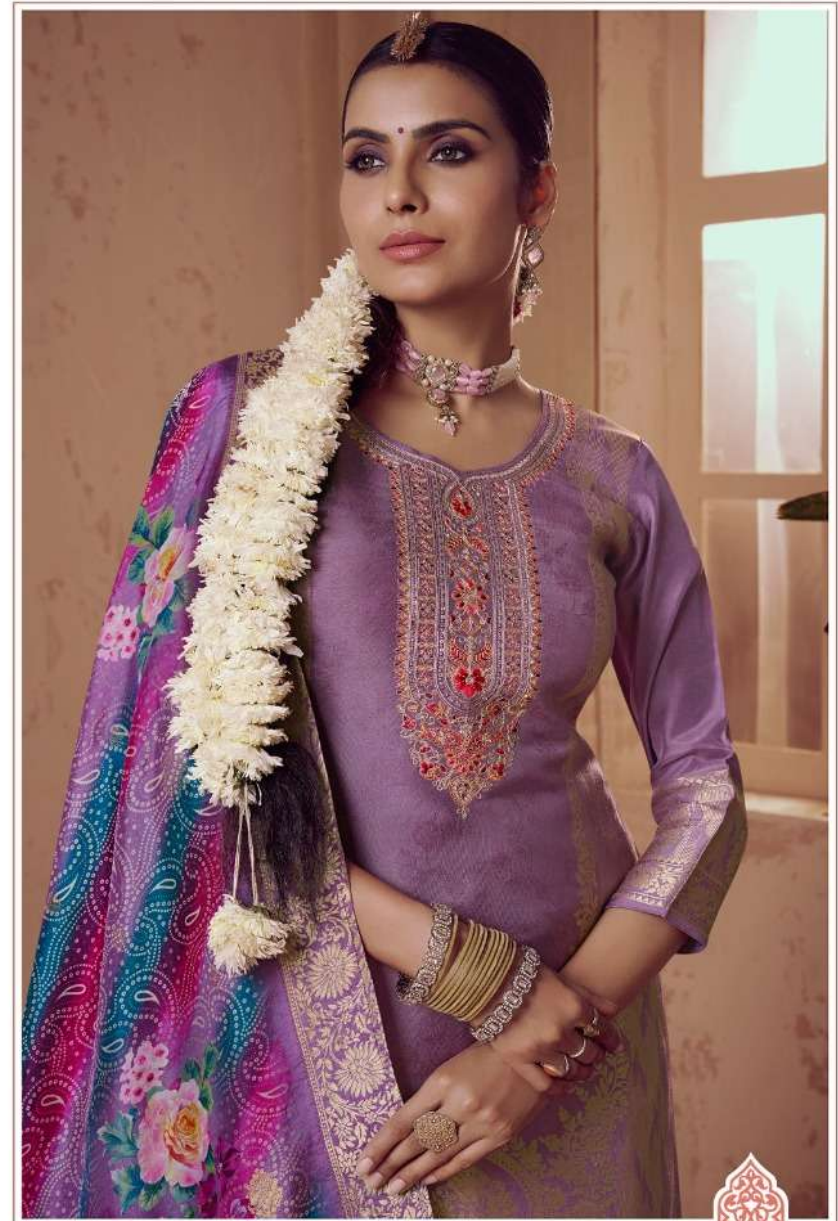
Perfect to define a class with panache