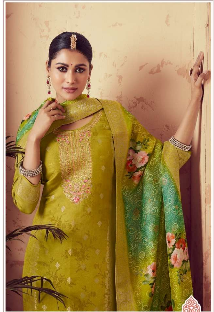
A polish, a sparkling, spirited yet delicate.