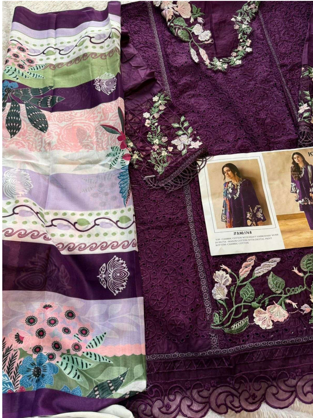
JT D.NO.176 B TOP - CAMBRIC COTTON WITH HEAVY EMBROIDERY WORK DUPATTA - MAGLIN COTTON WITH DIGITAL PRINT BOTTOM - CAMBRIC COTTON