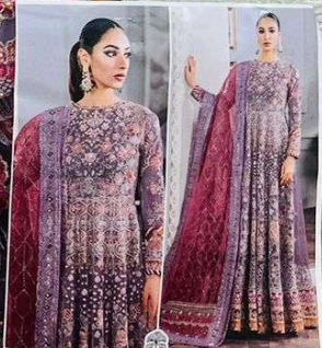
CHANTELLE ZAHA D No. 10293-E TOP Butterfly Net with Embroidery DUPATTA Butterfly Net with Embroidery