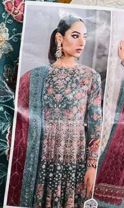
CHANTELLE ZAHA VOL. 5 TOP Butterfly Net with Embroidery BOTTOM-INNER Dual Lattice DUPATTA Butterfly Net with Embroidery