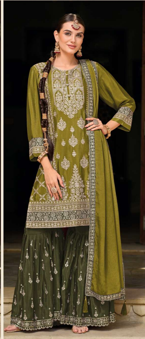
10001 - C