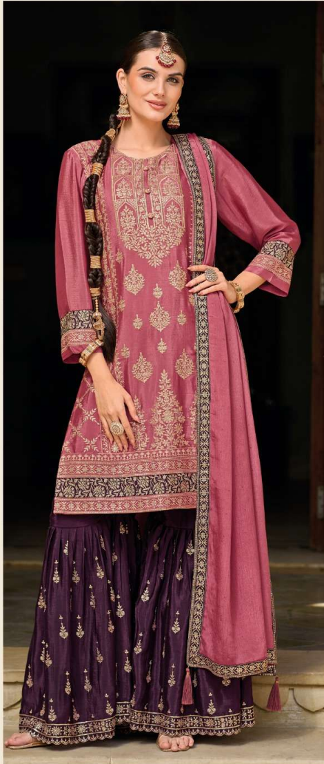
10001 - A