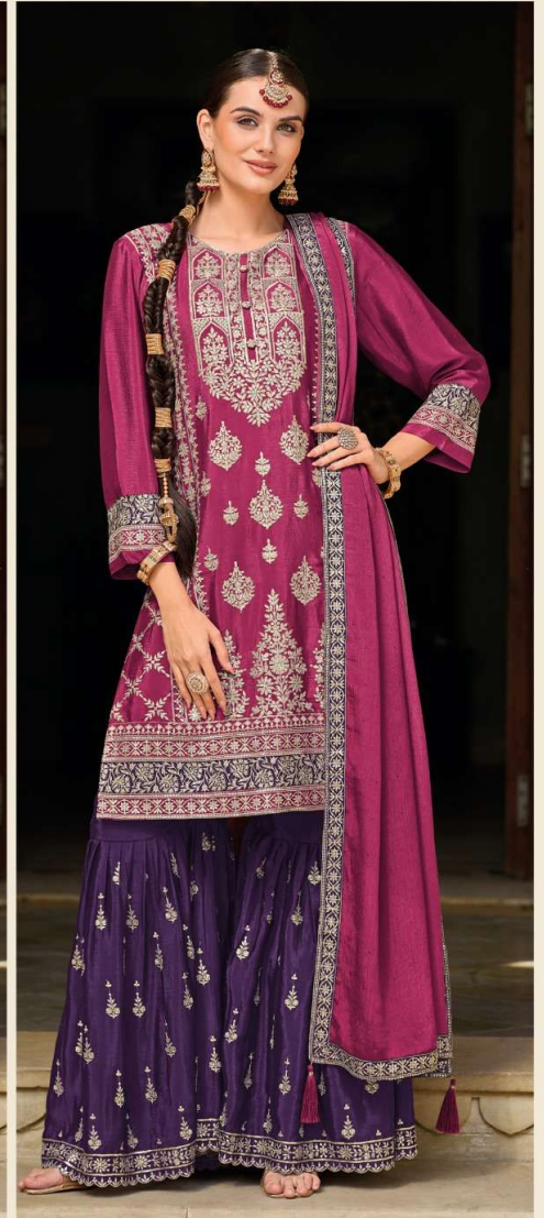
10001 - D