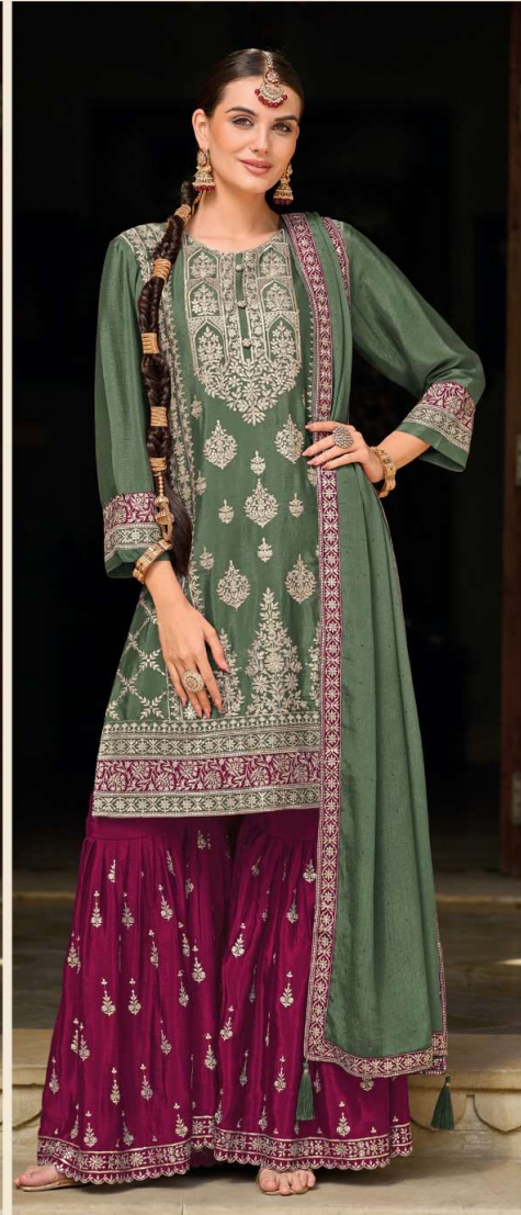
10001 - B