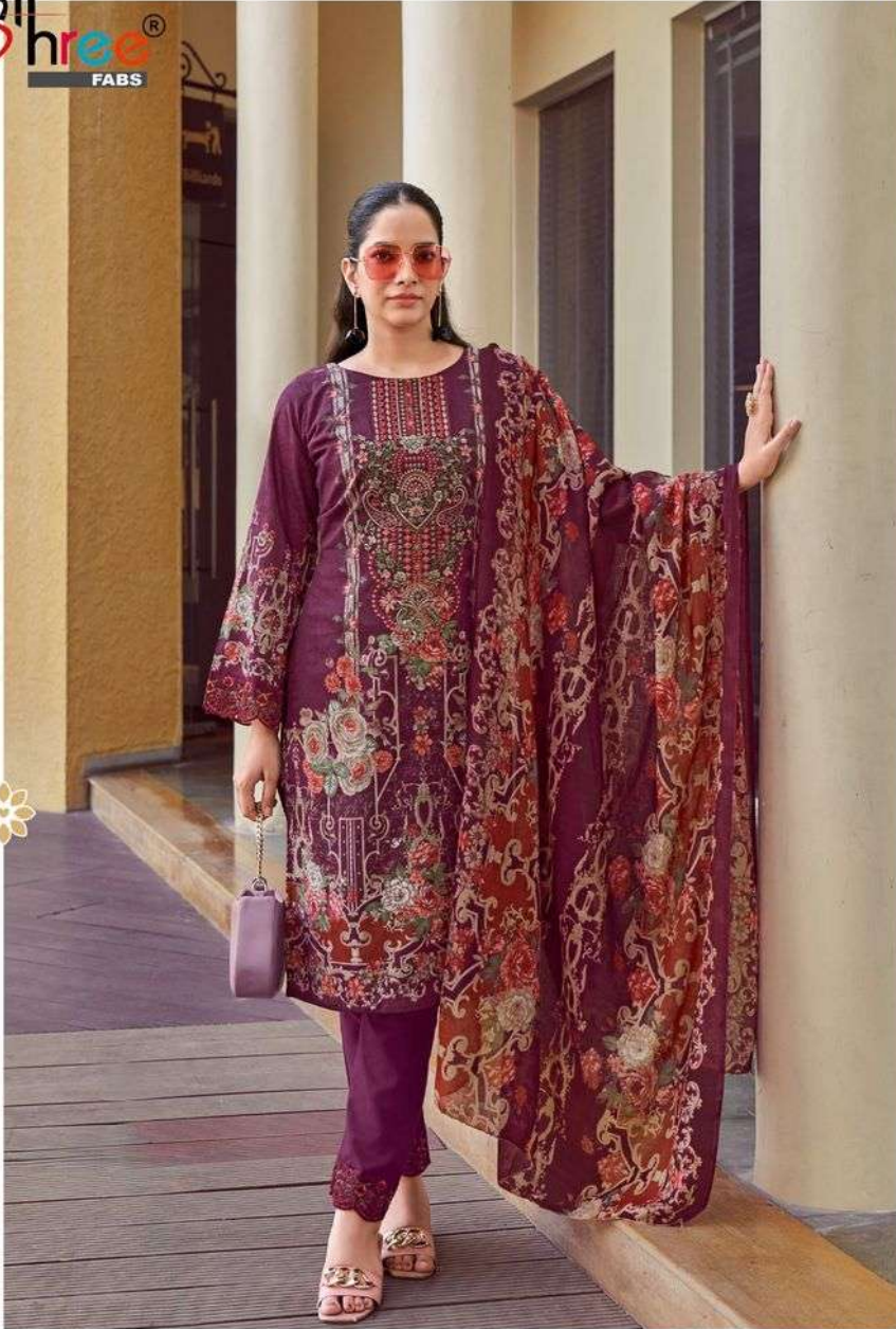
"Floral Elegance, Ethnic Charm"