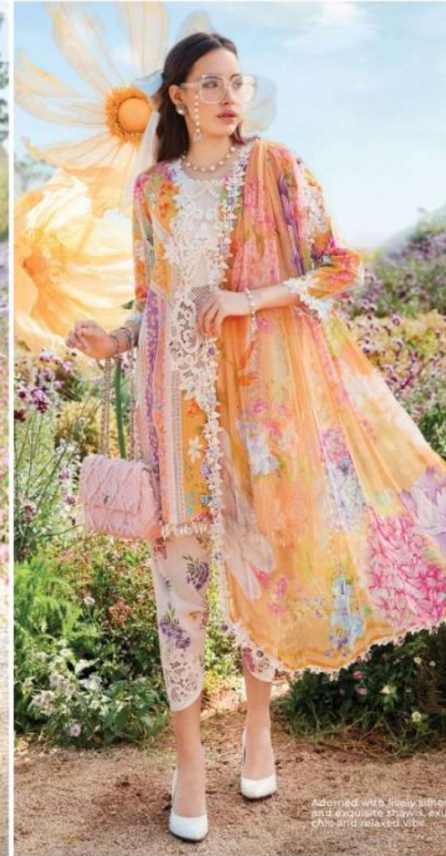
D NO 17003