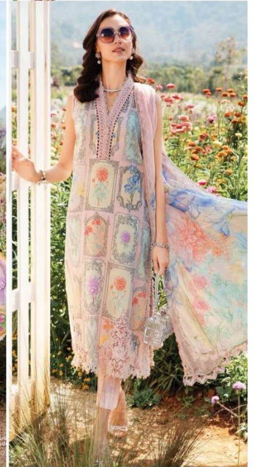
D NO 17004

Adorned with lively silhouettes and exquisite shayes, exude charm and relaxed vibes.