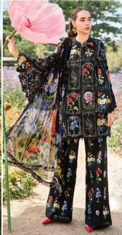
D NO 17002