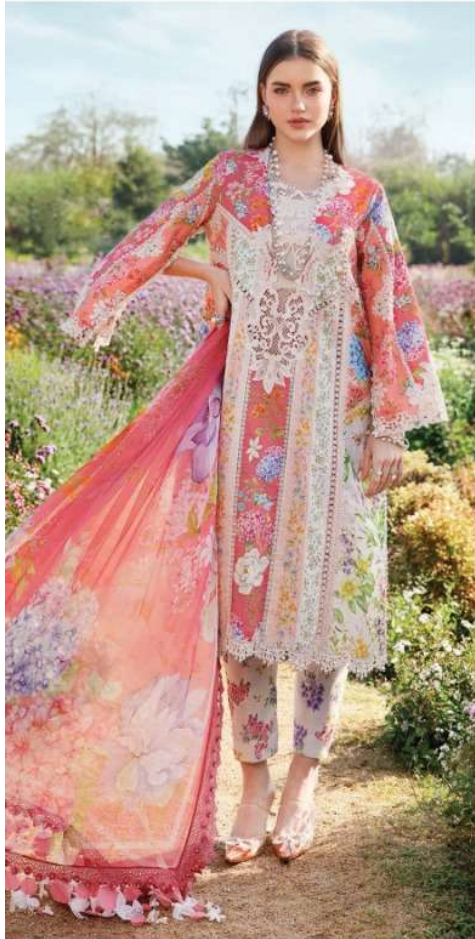
D NO 17001