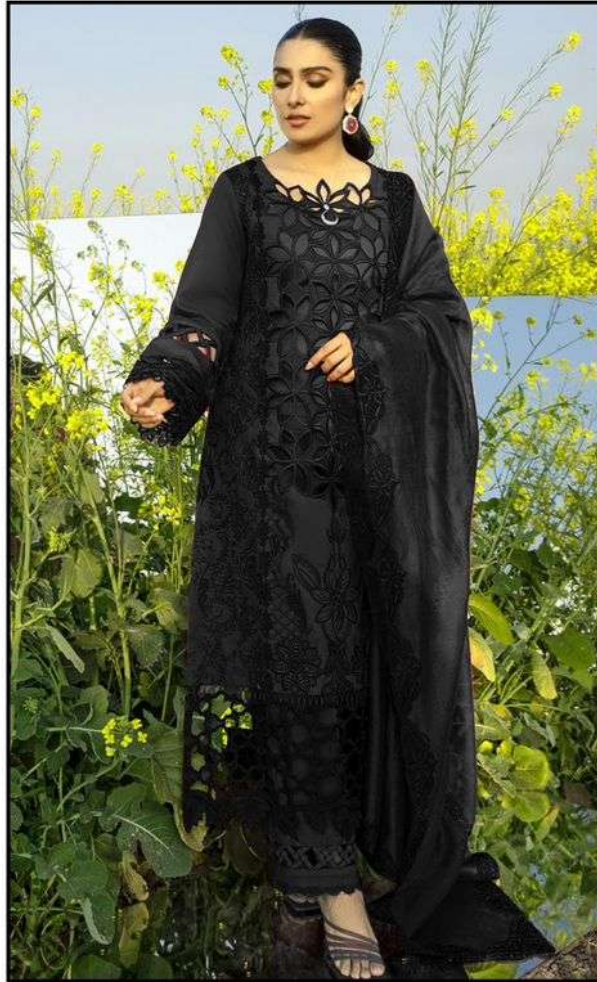
JT D.NO.154 C

TOP:- CAMBRIC COTTON WITH HEAVY EMBROIDERY WORK WITH (PERALS MOTI WORK)