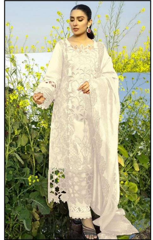
JT D.NO.154 D

DUPATTA :-KOTA CHECKS WITH HEAVY EMBROIDERED