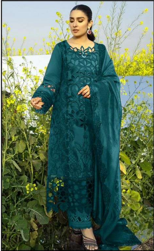
JT D.NO.154 B

TOP:- CAMBRIC COTTON WITH HEAVY EMBROIDERY WORK WITH (PERALS MOTI WORK)