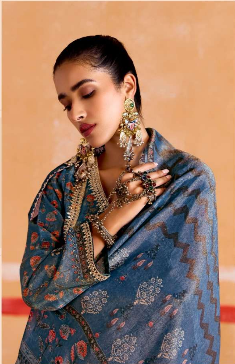
9544 Style is the way you carry your dress with confidence and charm.