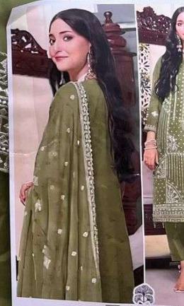
TOP: Filux Georgette with Embroidery (40% Cotton) BOTTOM: INIER (100% Cotton)