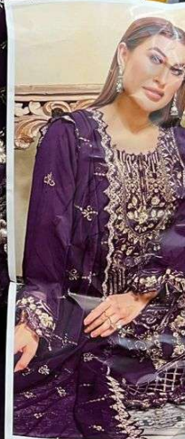
TOP Faux Georgette with Embroidery (Cut-2.5 Mtr.) BOTTOM-INN