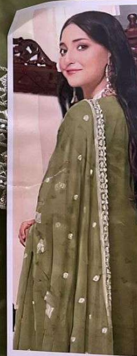
Faux Georgette with Embroidery TOP BOTTOM