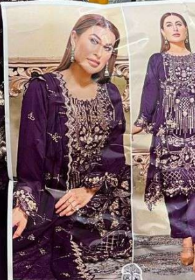
ZAHA D.N TOP: Faux Georgette with Embroidery (Curt 2.5 Mtr.) BOTTOM: INNER: Chiffon (Curt. 1.5 Mtr.)