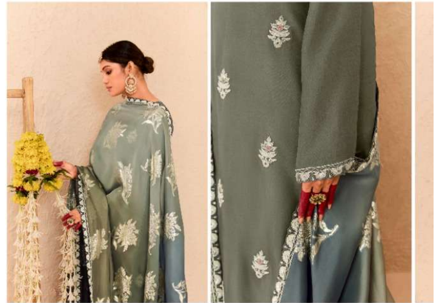
The dress was adorned with sparkling sequins that shimmered in the spotlight