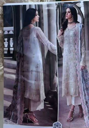
GULAAL VOL.1 TOP: Faux Georgette with Embroidery ZAHA D.No.1 DUPATTA