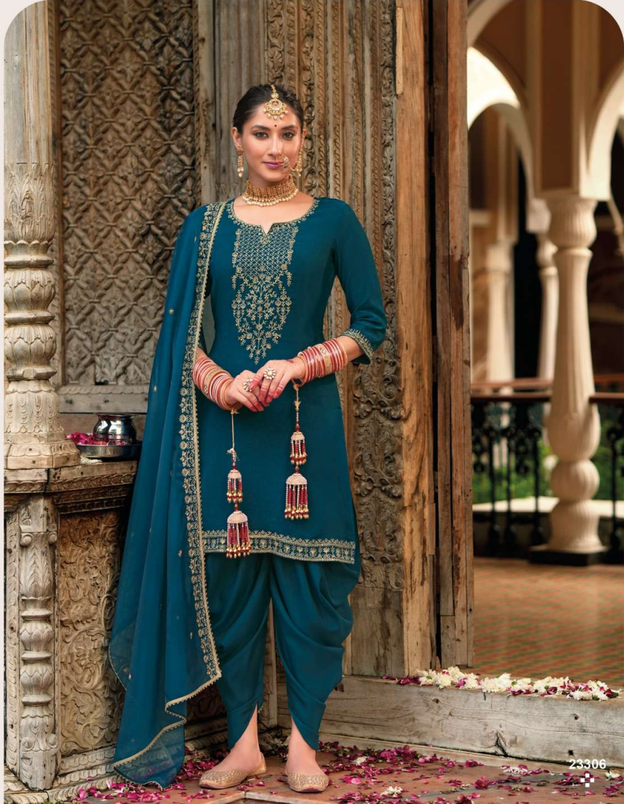
Fashion is about dreaming and making other people dream