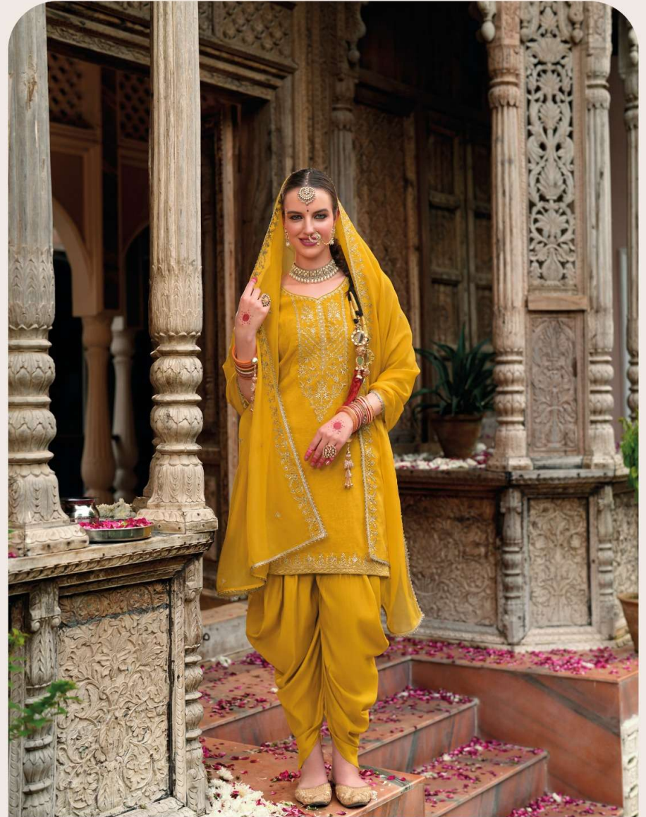
Elegance is not standing out, but being remembered