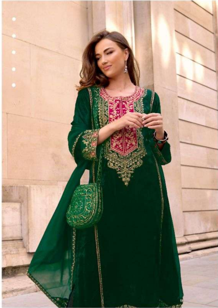
Indian Fashion Salwar Kameez and Kurtis are all the way comfortable yet elegant and easy to wear. Designer Kurtis, Salwar Kameez and Chander are the latest trend in Indian Fashion, suits are embellished with gorgeous embroidery work in pleasing designs, they manage to look smart enough to be worn for casual family gatherings, or even for a wedding ceremony.