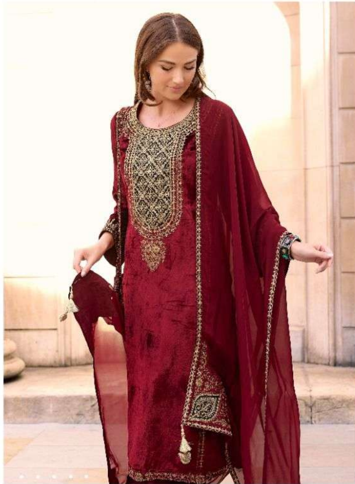
Nowadays designs are created keeping in mind the trendsfabrics and colors of the season by fashion designers and manufacturers. Offbeat garments, Kurti and Tunic, Indian Fashion Kurti and Tunic are very much in fashion these days. Kurti (Tunic/Top) is just a women top. It is now regional Kurti over pants, Salwar, Pant, Capri and even a skirt. Indian Kurtis/Tunic/Top are accepted worldwide. Kurti (Tunic/Top) look decor, endurescore, versatile and stylish, trendy yet modest.