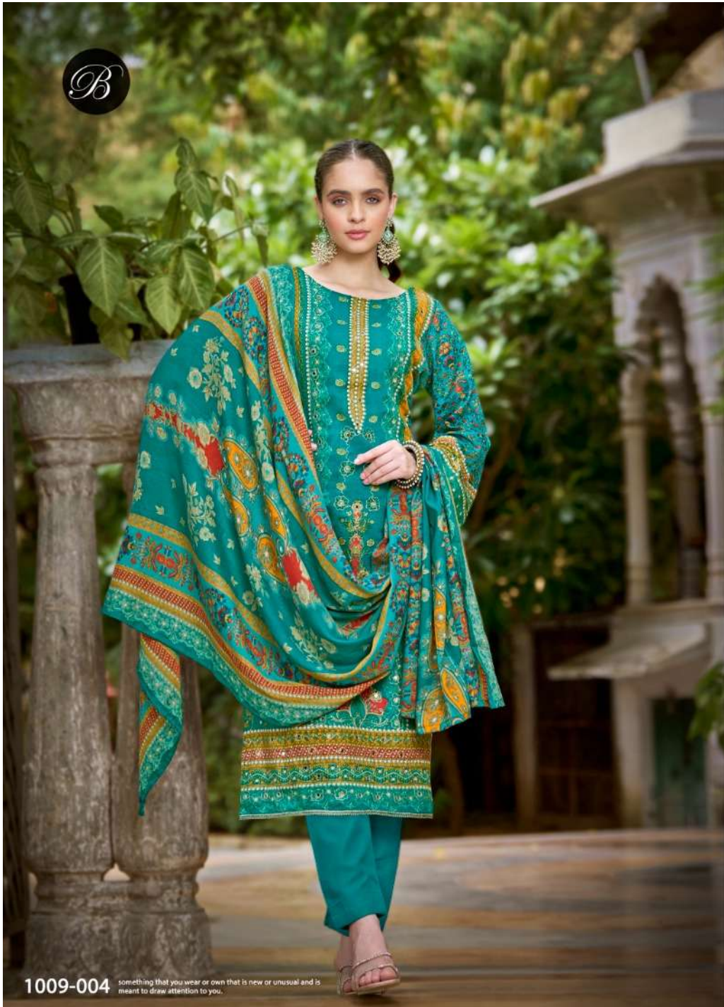
1009-004 something that you wear or own that is new or unusual and is meant to draw attention to you.