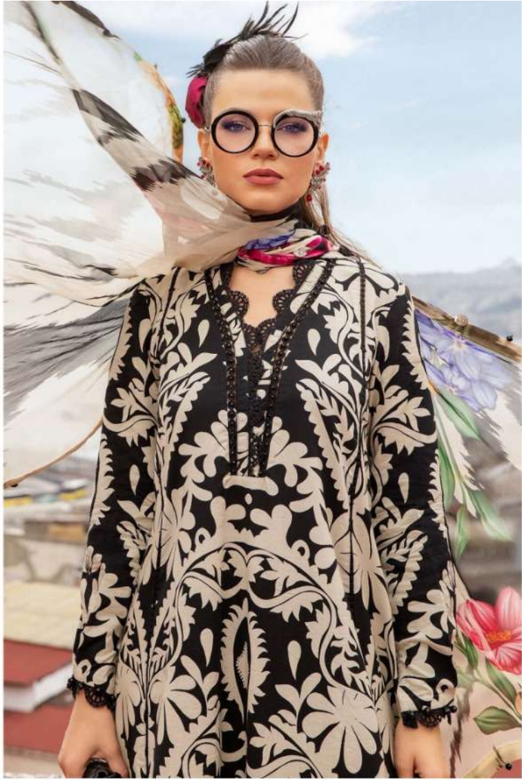
16002 A M PRINT-16