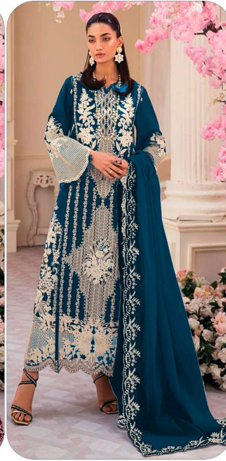
D.No | 303-C