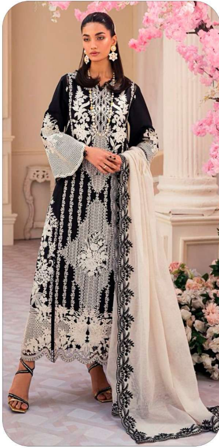
D.No | 303 A

TOP - Rayon With Embroidery DUPATTA - Kota Chex With Embroidery BOTTOM - Rayon