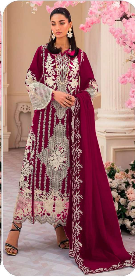
D.No | 303-B