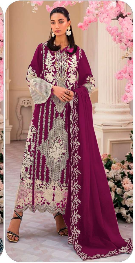
D.No | 303-D