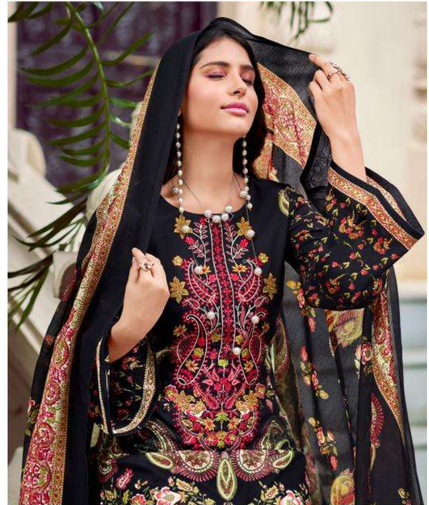
Evoke the Indian ethos in your style with Mumtaz