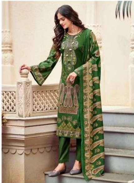
MUSAFIR | 19003