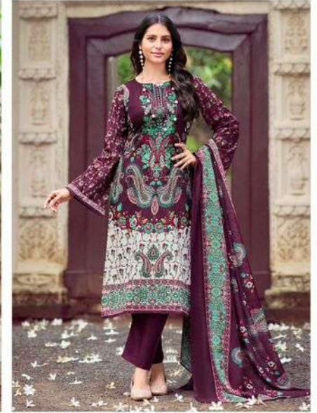
MUSAFIR | 19006