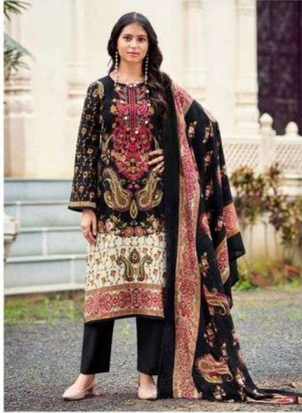
MUSAFIR | 19001