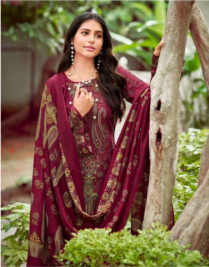
Showing an unparalleled collection of season's best fashion trends!