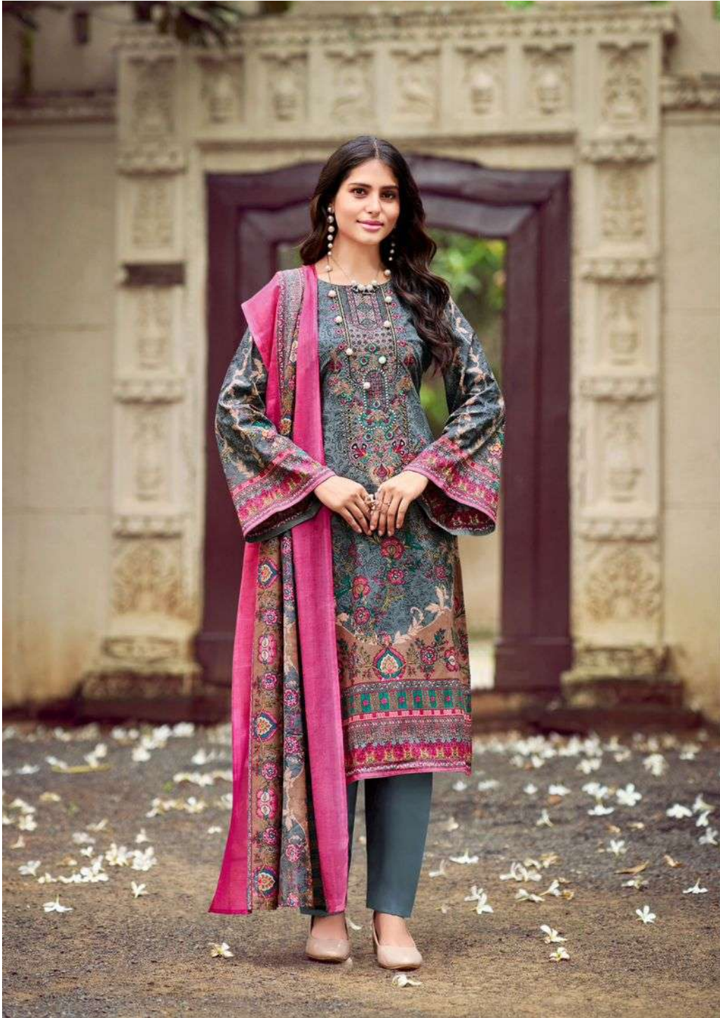
Fall in love with flawless finishing and textures that are sure to make heads turn.