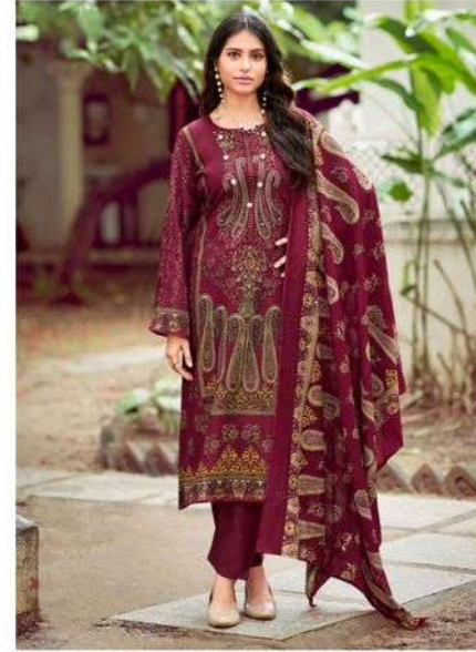
MUSAFIR | 19005