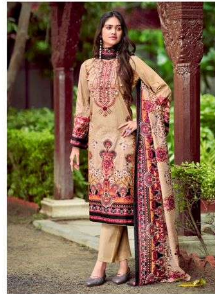
MUSAFIR | 19007