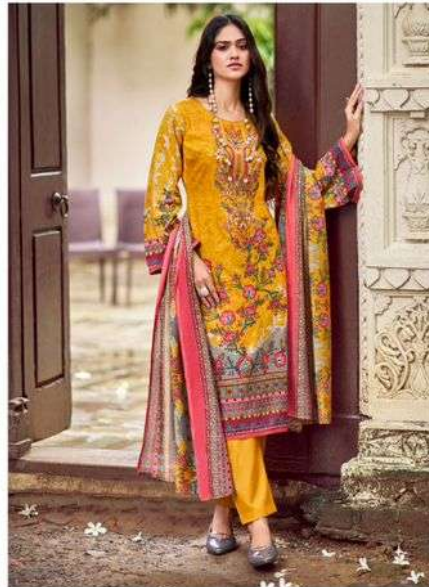
MUSAFIR | 19004