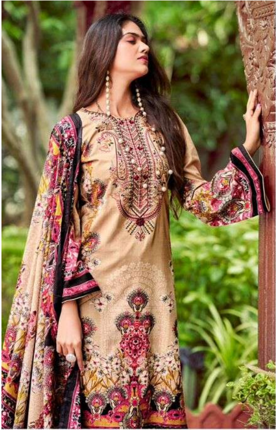
Mumtaz is a reflection of Ethnicity, it speaks about all things that are bright, happy, comfortable & festive.