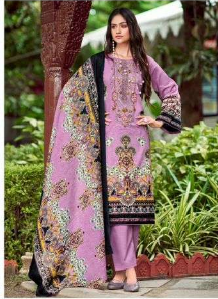
MUSAFIR | 19002