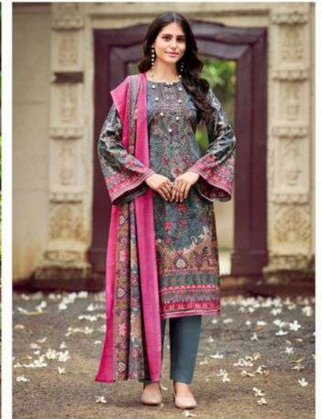
MUSAFIR | 19008