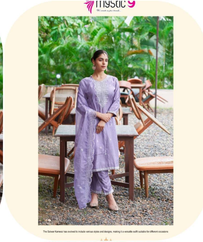
The Saraf Kurta has evolved to match various styles and designs, making it a versatile outfit suitable for different occasions.