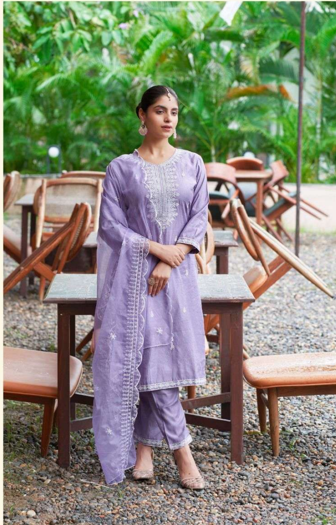
The Salwar Kameez has evolved to include various styles and designs, making it a versatile outfit suitable for different occasions