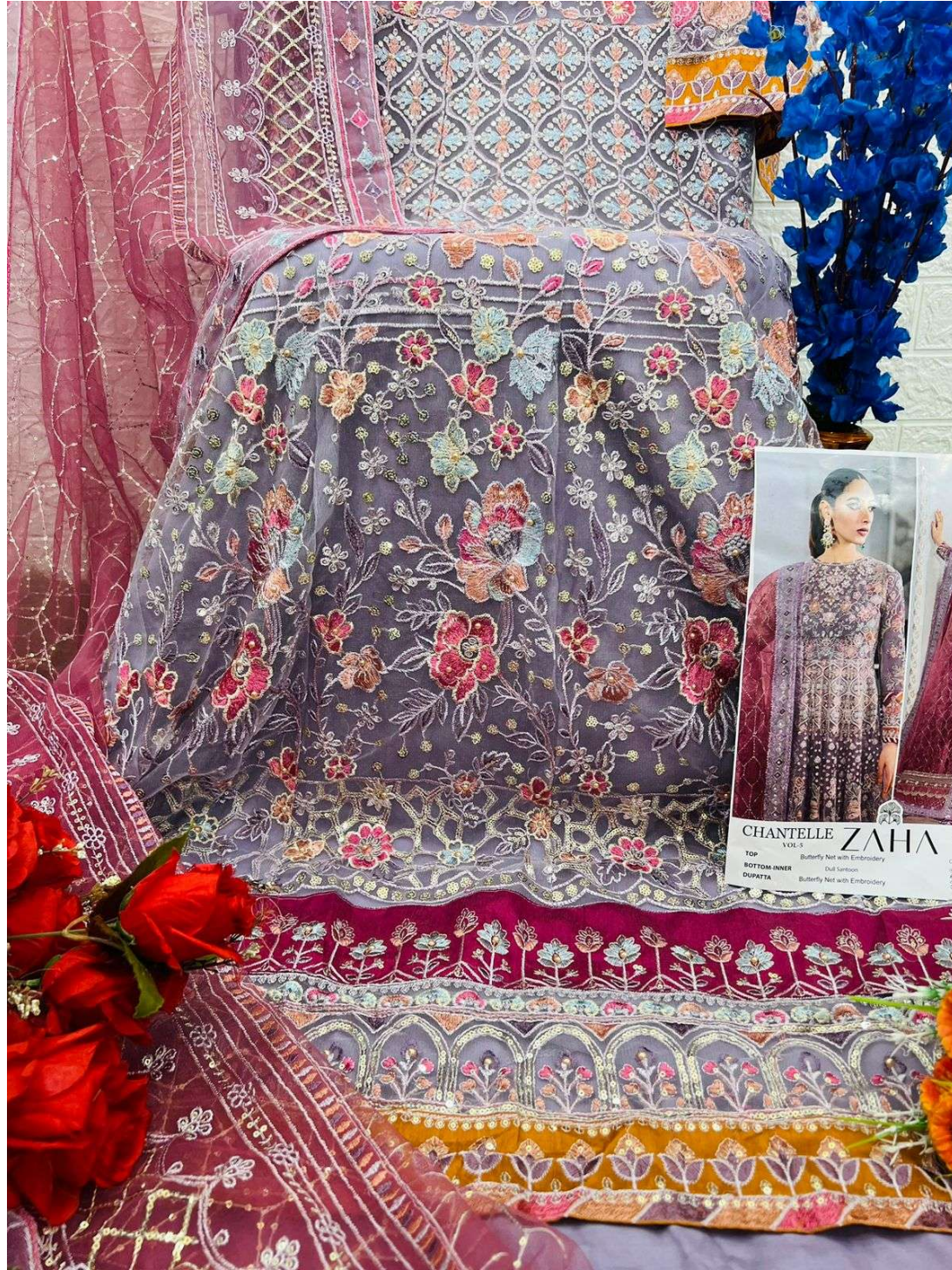
CHANTELLE ZAHA VOL-3 TOP Butterfly Net with Embroidery BOTTOM INNER Flat Satin DUPATTA Butterfly Net with Embroidery