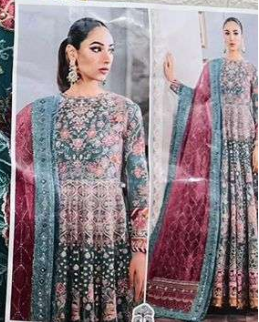
CHANTELLE ZAHIA D.No. 10293 VER. 1 TOP: Rubbery Net with Embroidery BOTTOM-INNER: Silk Satin BOTTOM-OUTER: Rubbery Net with Embroidery