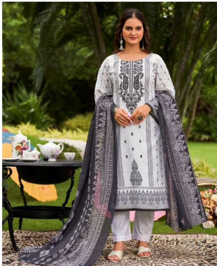
Dream in Fashion | 8015