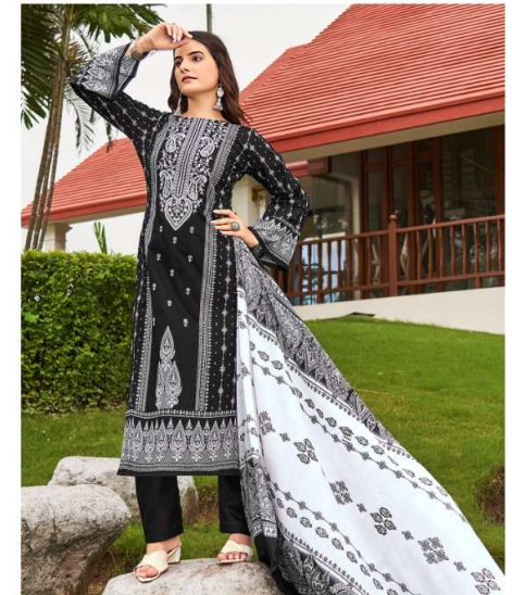
Dream in Fashion | 8020