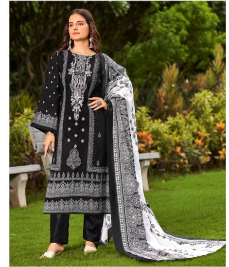
Dream in Fashion | 8018