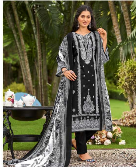
Dream in Fashion | 8014