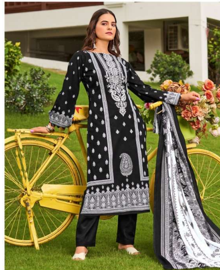
Dream in Fashion | 8016