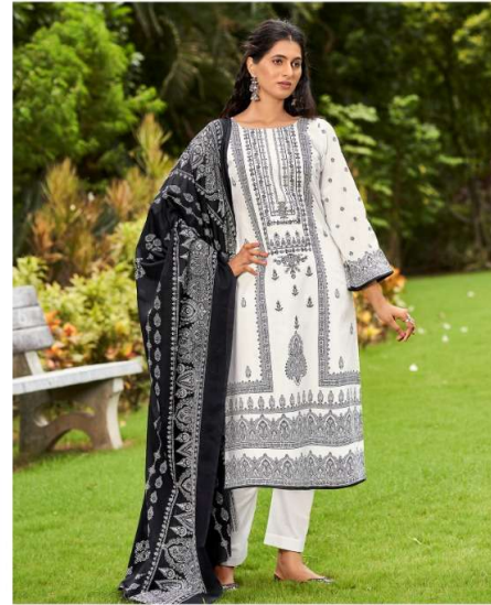
Dream in Fashion | 8017