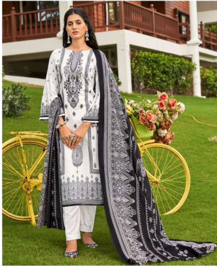
Dream in Fashion | 8013