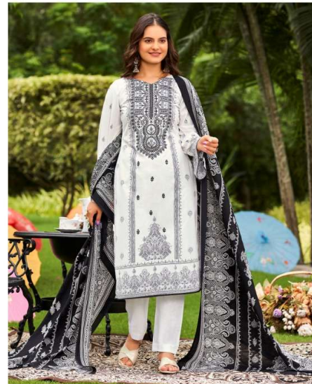
Dream in Fashion | 8019