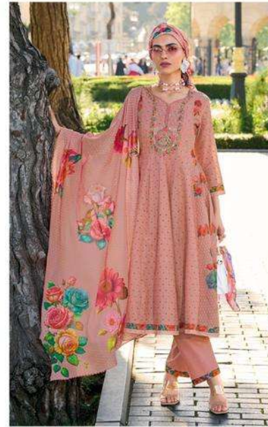
* 42715 *