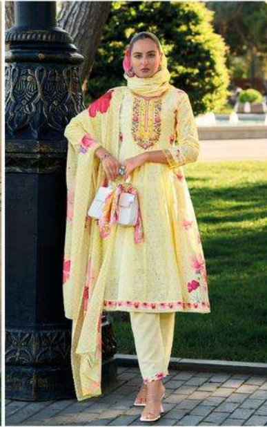
* 42712 *