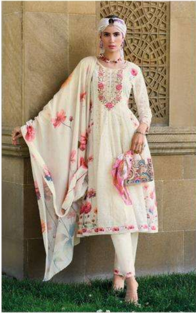
* 42711 *