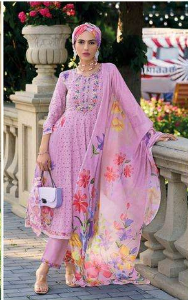
* 42714 *