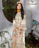
D. Na. 1000-A 100% - 100% COTTON WITH LACE AND EMBROIDERY DETAILS: 100% COTTON DE CALIDAD - COTTON DE ESTILO, WITH BEAUTIFUL FINISH