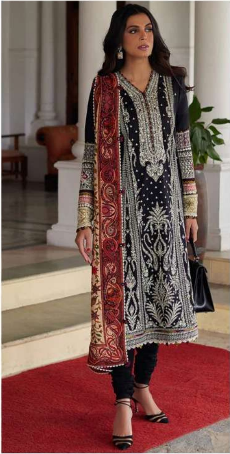
D NO 1001