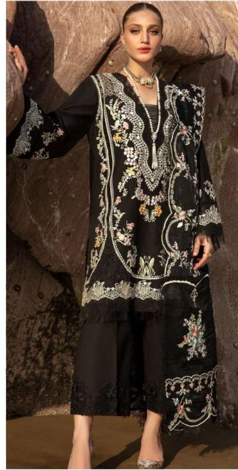
D NO 1003