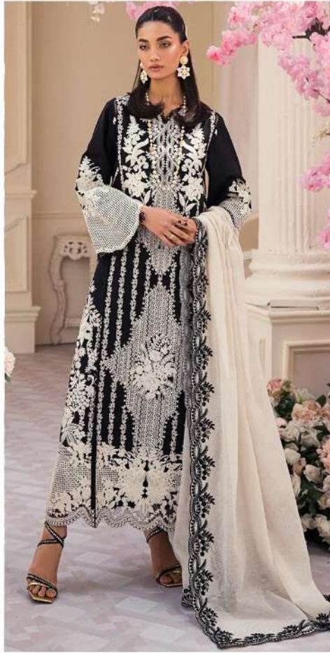
D NO 1002