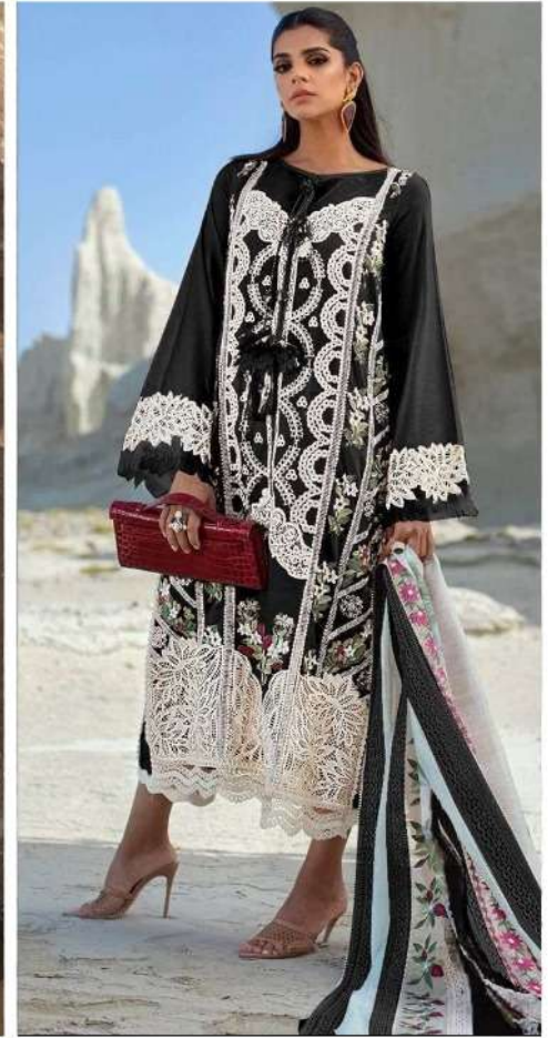
D NO 1004