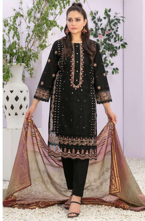
D.No | 254 C