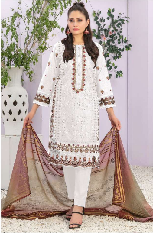
D.No | 254 A

TOP - Cotton With Embroidery DUPATTA - Shiffon/ Cotton With Digital Print BOTTOM - Santoon