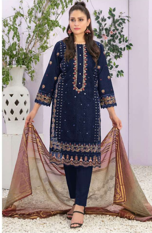
D.No | 254 B