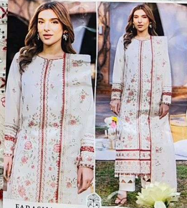
FARASHA VOL-2 ZAHA D.No. 0320 TOP: Cambic Cotton Heavy Embroider BOTTOM: INNER Green Lawn Butterfly Net with Heavy Embroidery