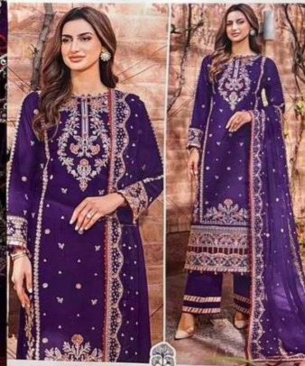
FARASHA VOL-1 TOP Cambric Cotton With Heavy Embroidery Work ZAHA D.No. 10 INNER DUPATTA