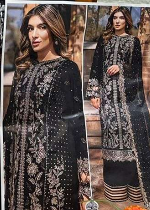
FARASHA ZAHARA VOL. 1 TOP Cambic Cotton With Heavy Embroidery