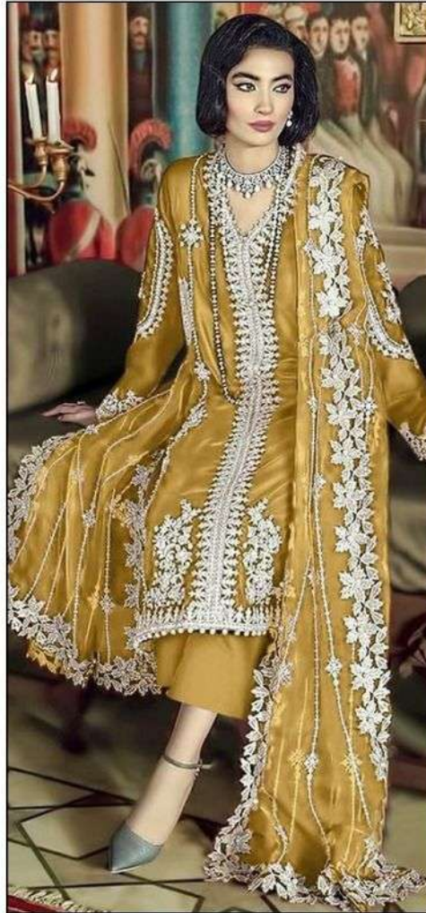
JT D.NO.139 B