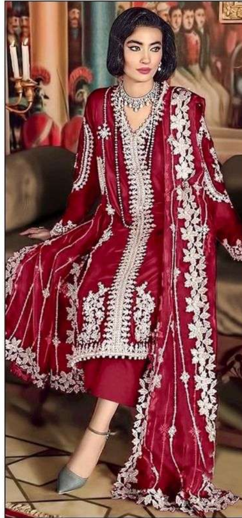
JT D.NO.139 C