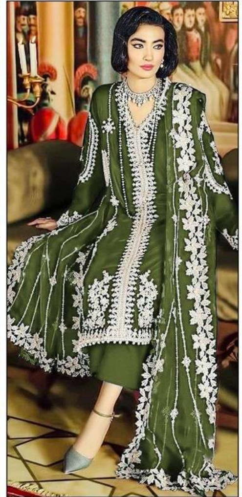
JT D.NO.139 D