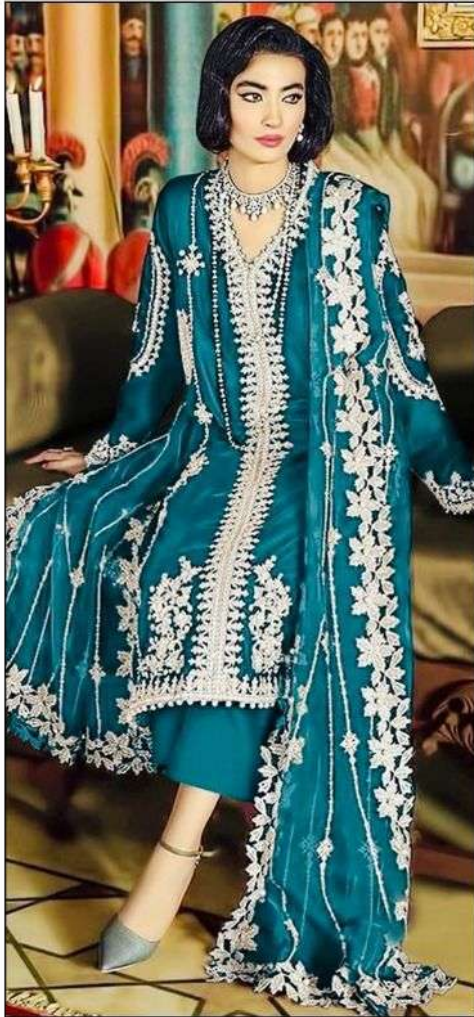
JT D.NO.139 A

TOP - ORGENZA WITH HEAVY EMBROIDERY (WITE PERALS MOTI WORK) BOTTOM - DULL SANTON DUPATTA - ORGENZA WITH HEAVY EMBROIDERY