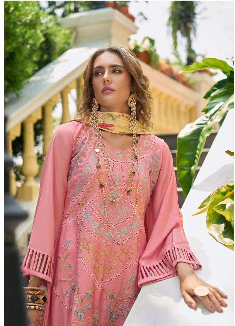
Neishi : 1001