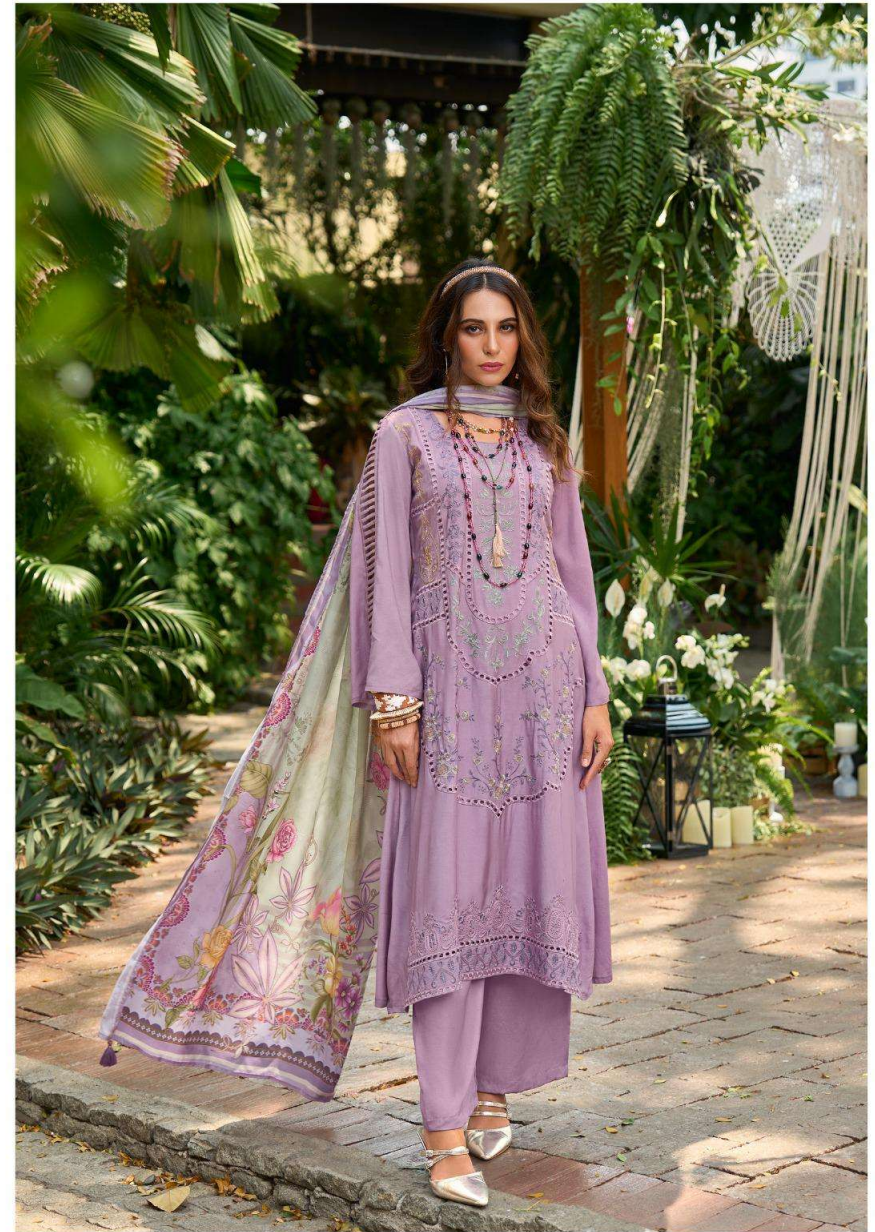
Neishi : 1005