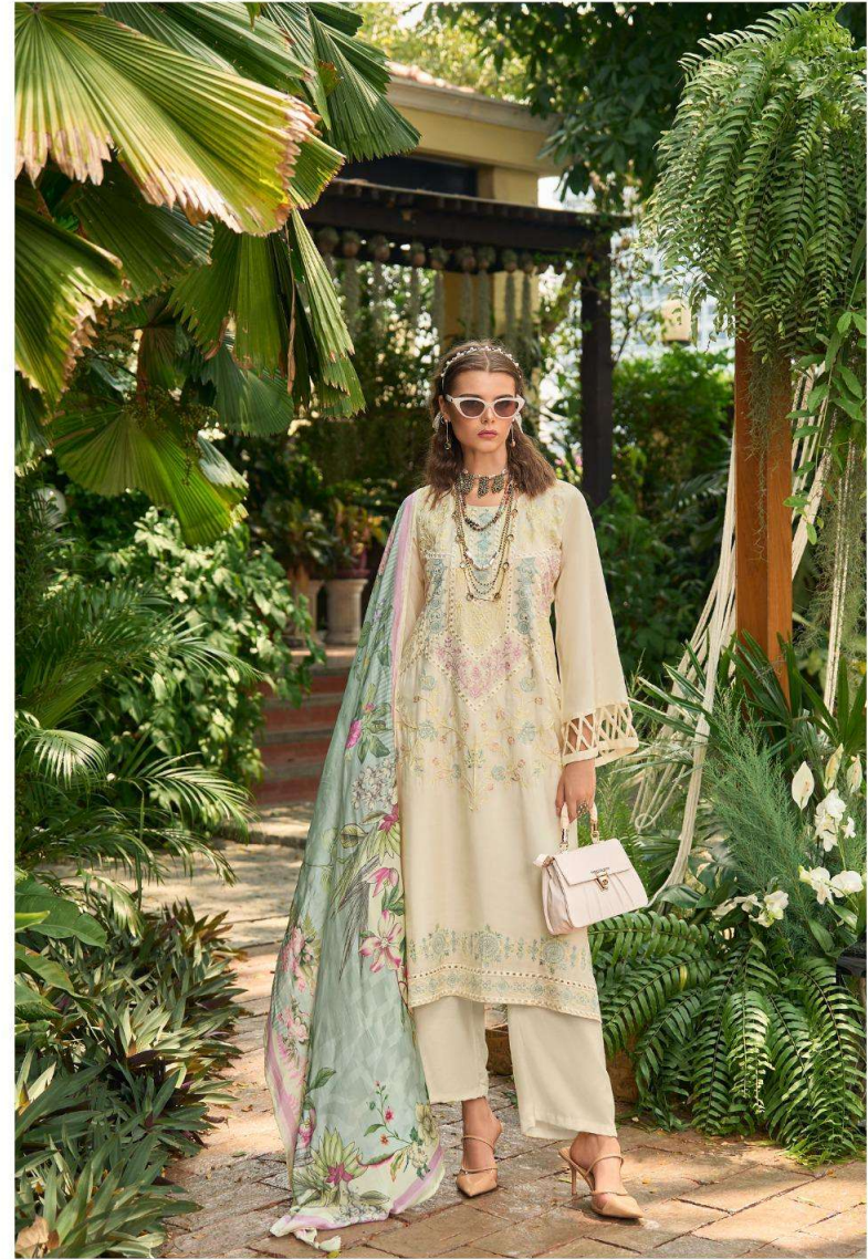
Neishi : 1004