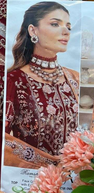
Ramsh TOP Faux G with E (Cut OM-INN