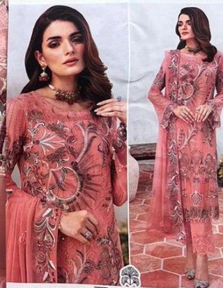
Shezlin ZAHA D.No.1024 TOP: Faux Georgette with Embroidery (Cut-2.5 Mr.) BOTTOM: INNER: Full Sarson DUPATTA: Net Emb (Cut)