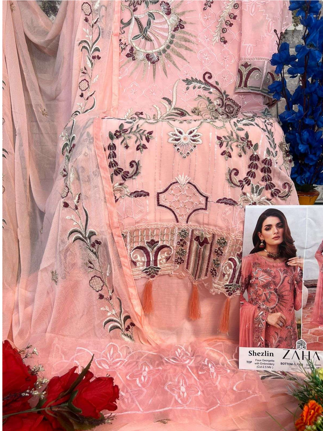
Shezlin ZAHA TOP Faux Georgette with Embroidery (Cut-2.5 Mtr.) BOTTOM-1.5 Mtr. Dotted Georgette (Cut-1.5 Mtr.)