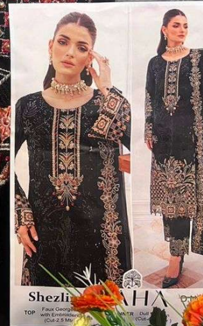
Shezli TOP: Black Geometric with Embroidery (Clus 2 & 3) SKIRT: Black Geometric with Embroidery (Clus 2 & 3)