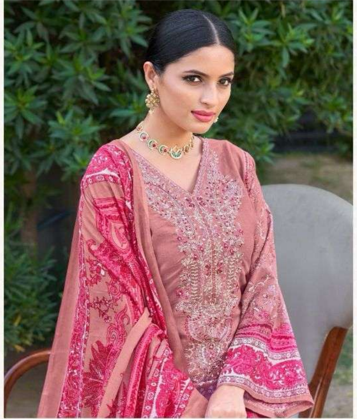
Exploring a Spectrum of brilliant colours with contemporary flair