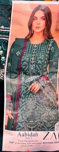
Aabidah ZAF VOL-1 Faux Georgette with Embroidery with hand work. BOTTOM-INNER (cut 2-5 Mr.)