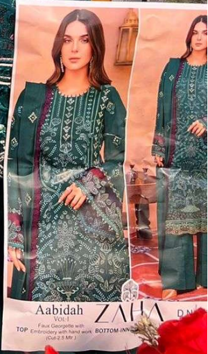
Aabidah VOL.1 ZAHARA D.N. TOP Embroidery with hand work BOTTOM INNER (Call 2-5 Mr.)