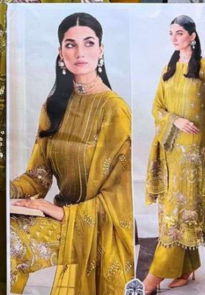
Aabidah VOLE Faux Georgette with Embroidery with hand work TOP (Cut 2 & 4/6) ZAHA D.No BOTTOM-INNER (Cut 2 & 4/6)